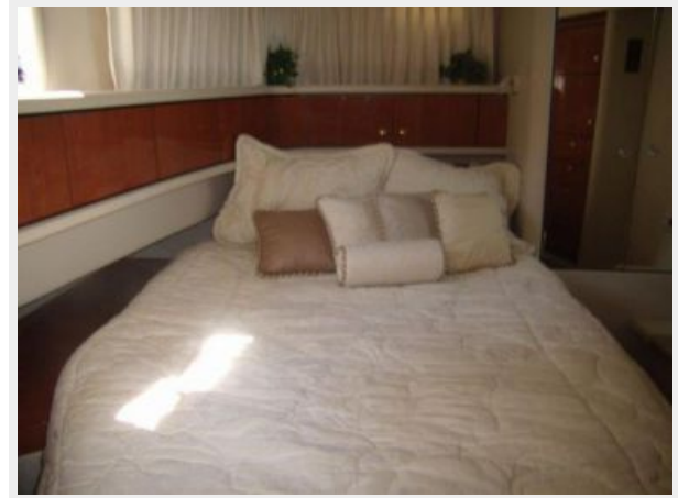
Master Stateroom 1