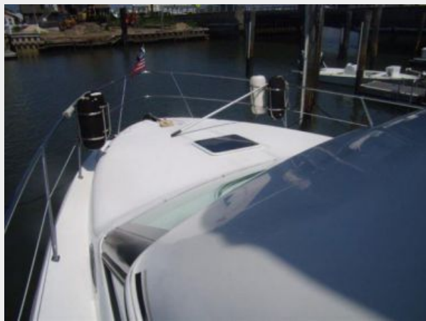
Deck 1 - Bow