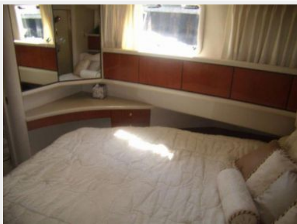
Master Stateroom 2