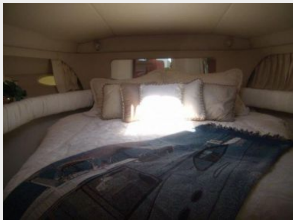
Guest Stateroom 1