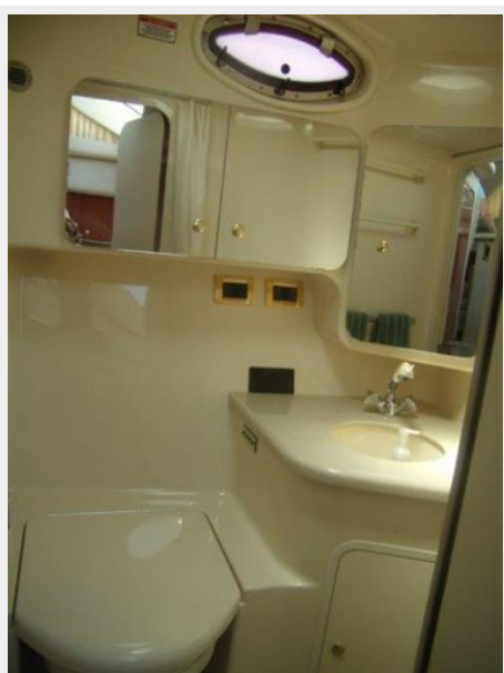
Master Head 1