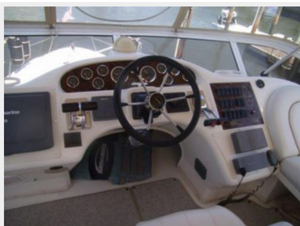
Helm / Electronics & Navigation 1