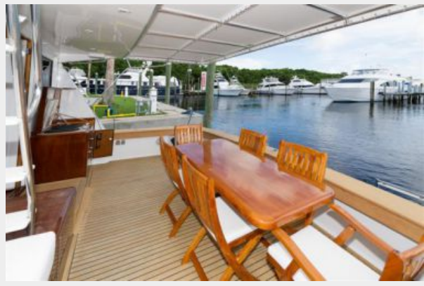
Aft Deck/Cockpit Looking Aft