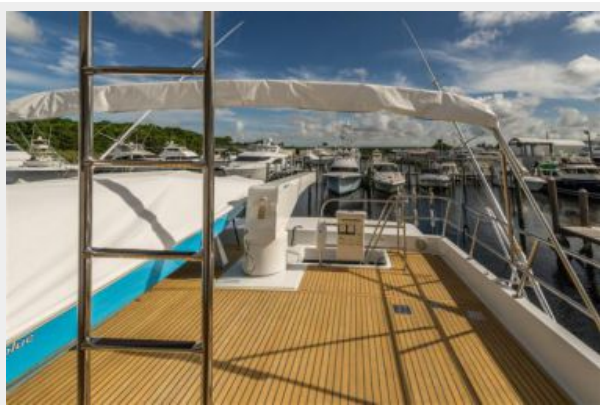
Boat Deck Looking Aft