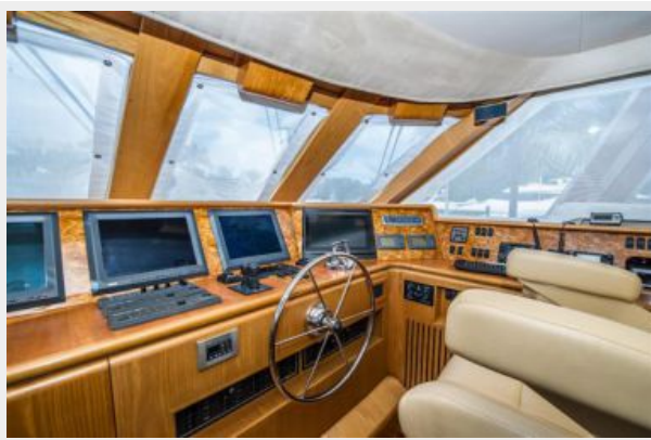
Pilothouse Helm Area