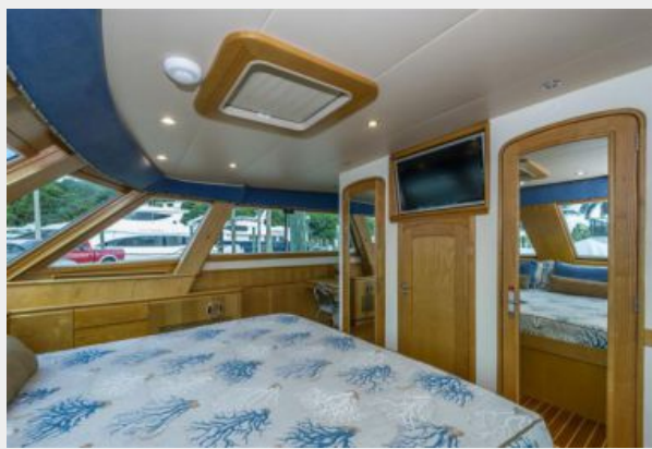
On-Deck Master Stateroom Aft