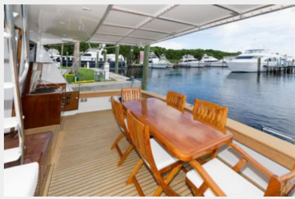
Aft Deck/Cockpit Looking Aft