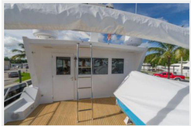
Boat Deck Looking Forward