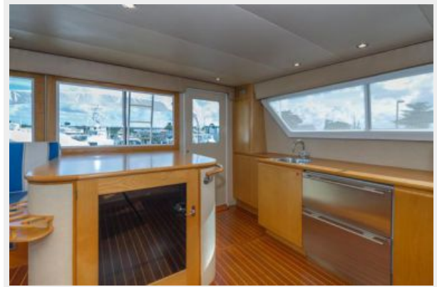
Pilothouse Looking Aft Port