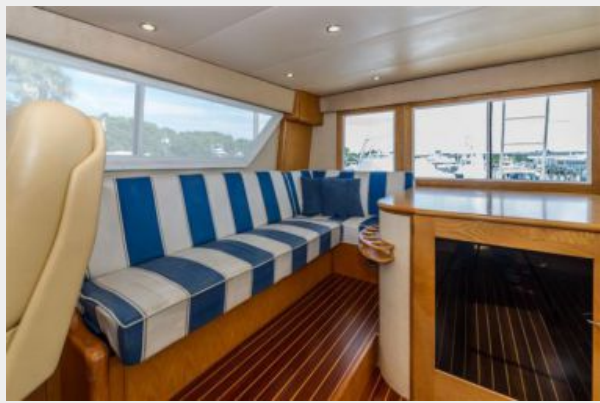
Pilothouse Looking Aft Starboard