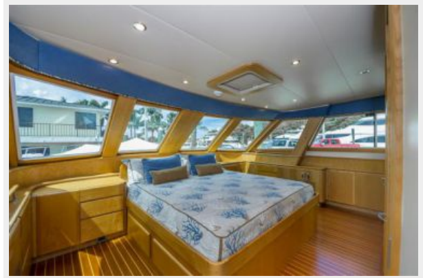
On-Deck Master Stateroom