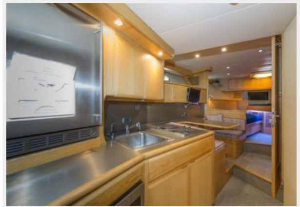
Crew Galley & Dinette - 1