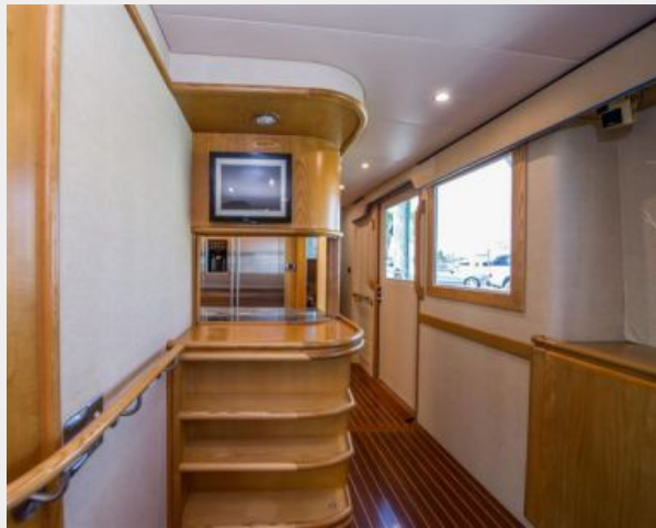
Starboard On-Deck Companionway