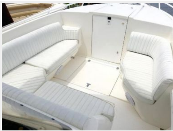
Entrance to Cuddy