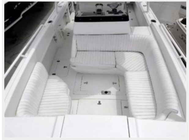
Seating Forward of the Helm