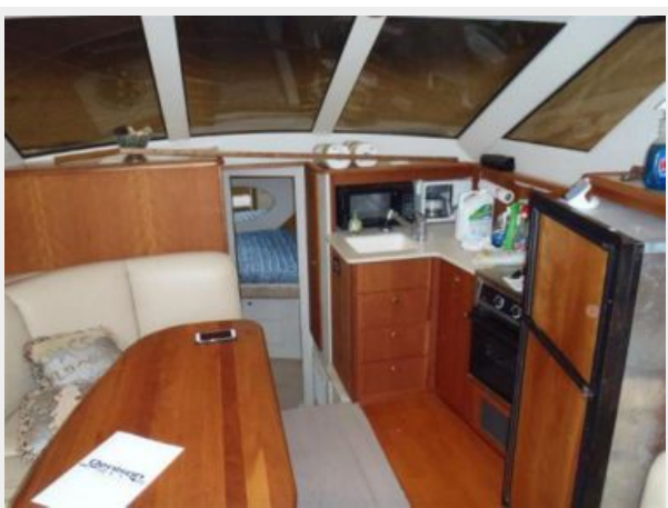
Main salon and galley