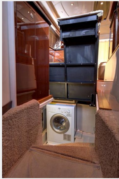
Guest Stateroom (Starboard)