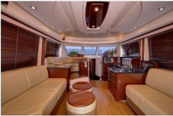
Salon facing bow