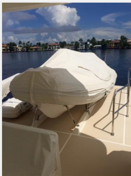
14' Tender with Cover