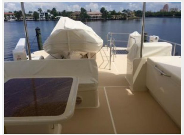
Bridge Aft with Tender