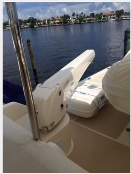
Davit & Life Raft