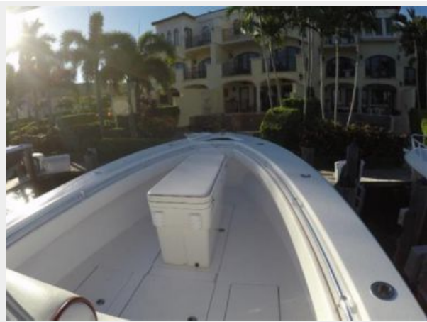
Bow Coffin Box