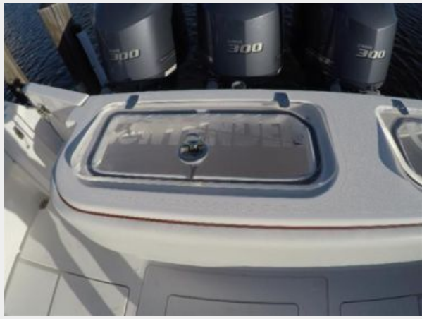
Starboard Live Well