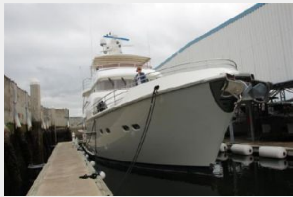
At the Dock