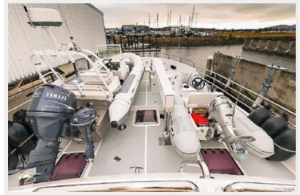
Boat Deck to Bow