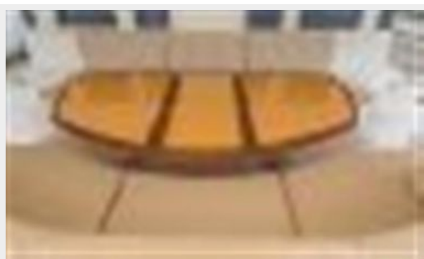
Pilothouse Aft Deck Dinette