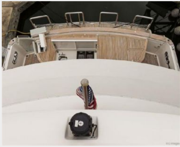
FLybridge view of Cockpit