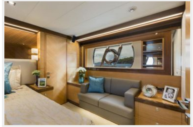
Master Walk-In Closet