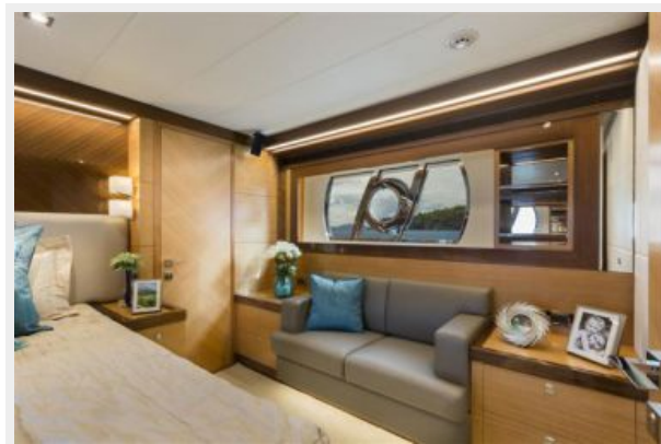
Master Walk-In Closet