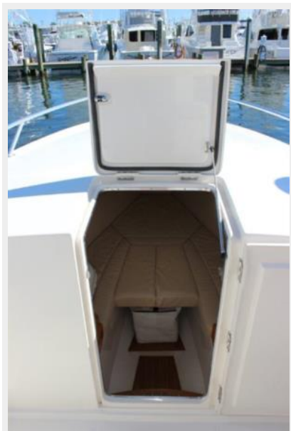
Cuddy Cabin 1 - Entry to Cuddy