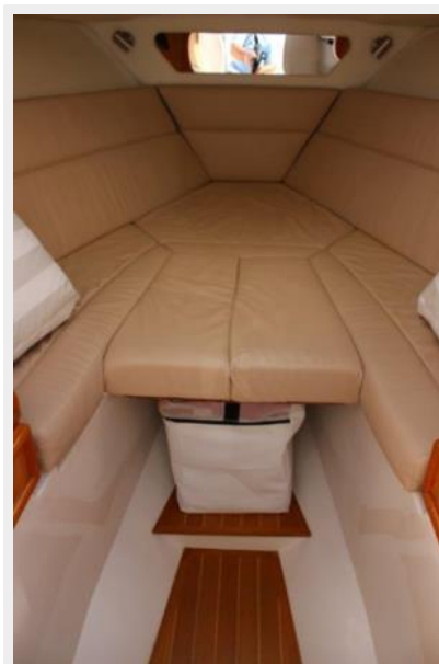
Cuddy Cabin 2