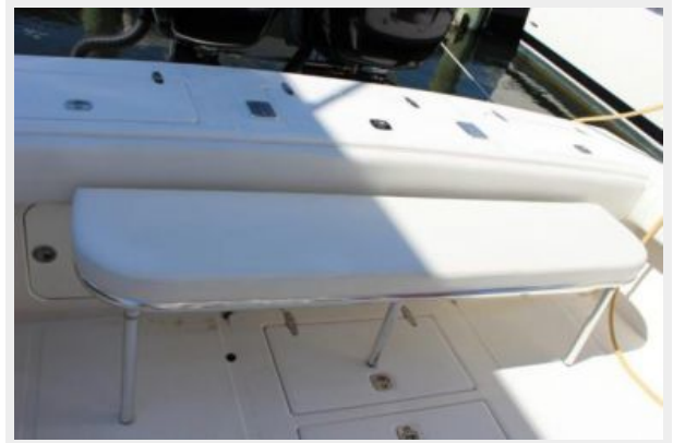
Deck 7 - Transom Seating