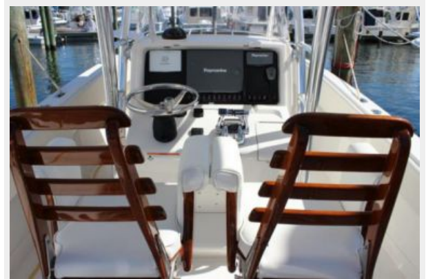
Helm / Electronics & Navigation 1