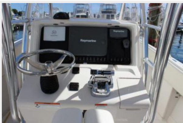
Helm / Electronics & Navigation 2