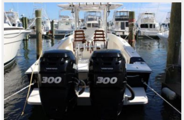
Engine & Mechanical Equipment 1 - 300 Verados