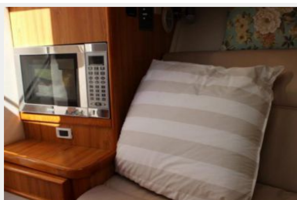
Cuddy Cabin 3