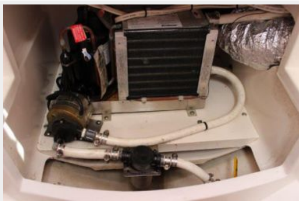
Engine & Mechanical Equipment 2 - AC