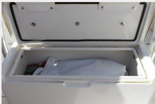
Deck 8 - Storage Under Forward Console Seating