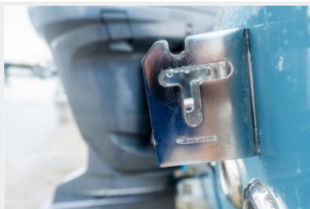
Armstrong Swim Ladder Bracket