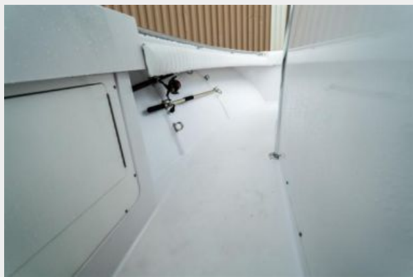
Forward Coaming Bolster