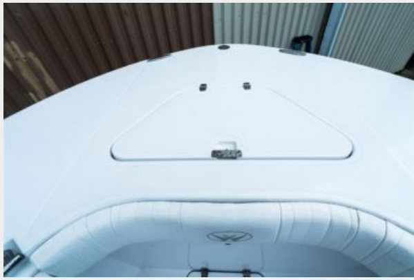
Anchor Locker Closed