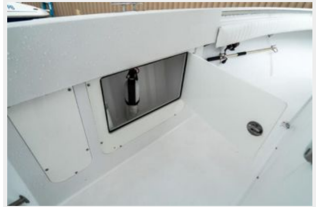
Port Fire Extinguisher