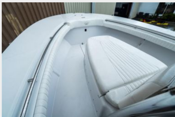
Forward Sunpad/Fish Box 1