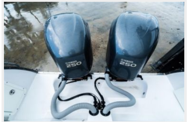
Engines (Optimus JoyStick)