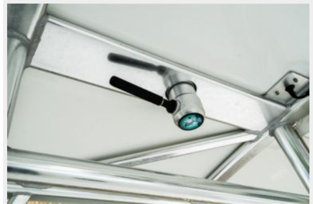
Taco Grand Slam Outriggers