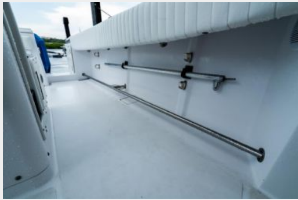
Cockpit Rod Storage/Toe Rail Port