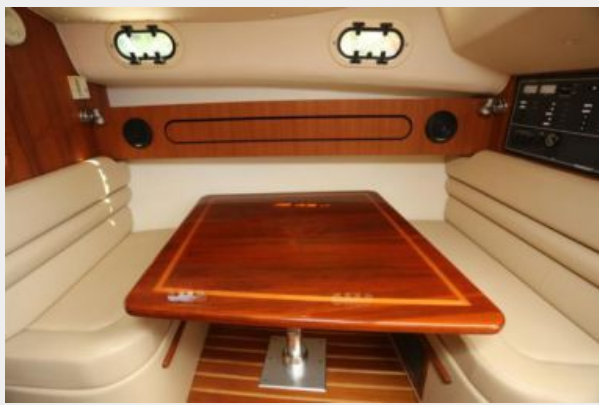
Dinette & Second Berth