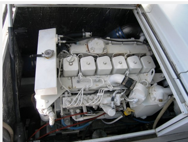
Main Engine Port