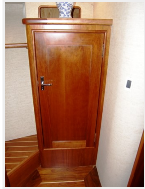
Master Hanging Locker