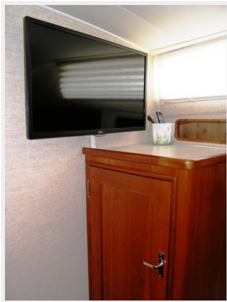
Master TV & Locker