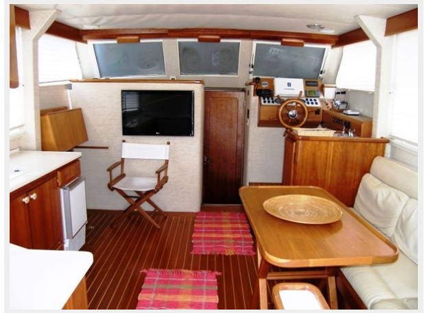
Salon View Forward