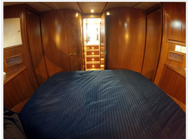
Prima 45 master stateroom aft