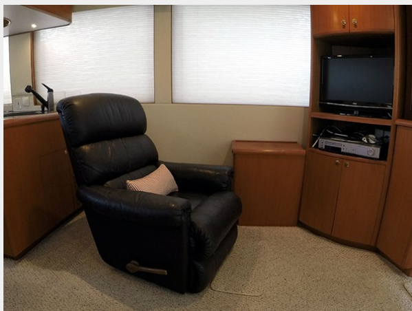
Prima 45 salon starbaord