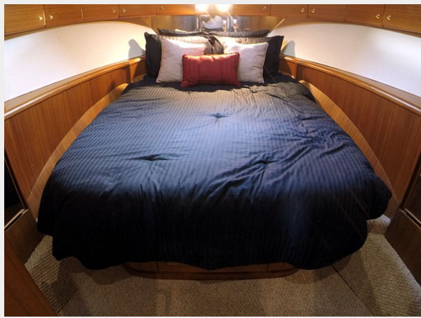
Prima 45 master stateroom