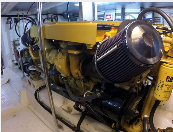
Prima 45 port main engine