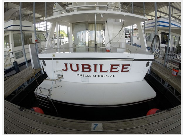
Prima 45 swimplatform