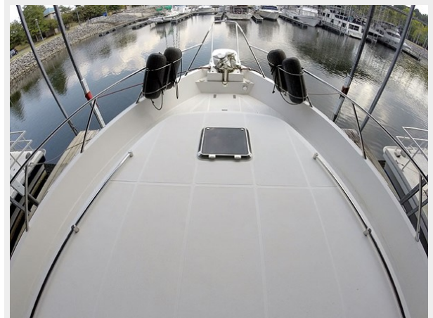
Prima 45 foredeck