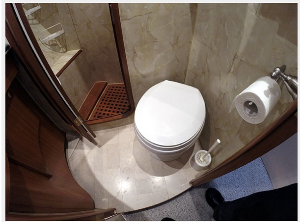
Prima 45 Guest Head Wide