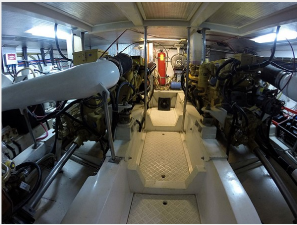
Prima 45 engine room forward