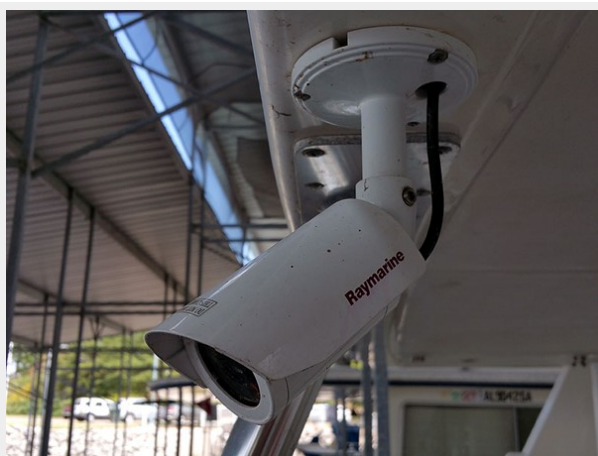
Prima 45 aftdeck camera