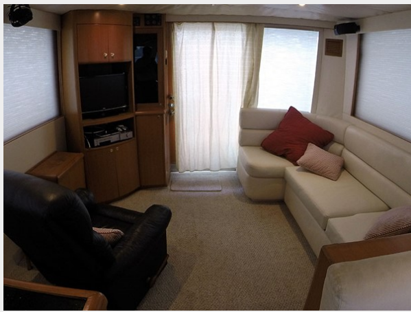
Prima 45 salon aft