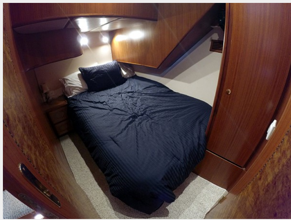
Prima 45 guest stateroom