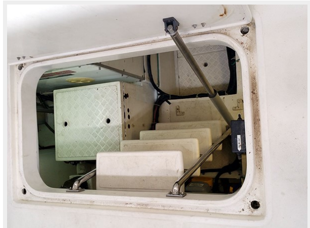
Prima 45 engine room access