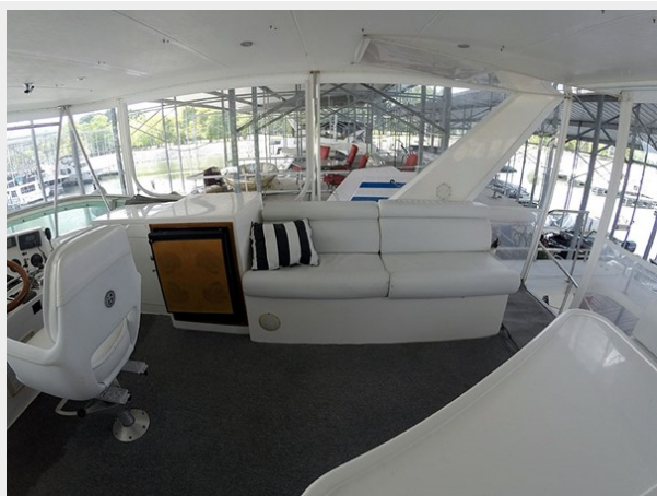
Prima 45 flybridge starboard