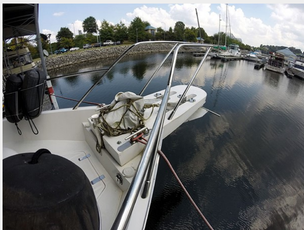
Prima 45 pulpit