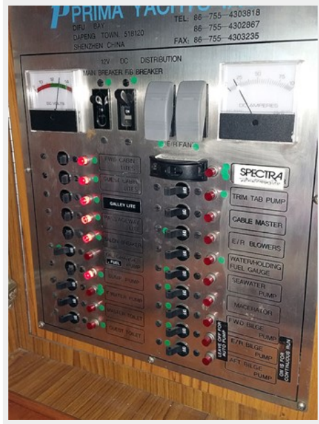
Prima 45 electrical panel1