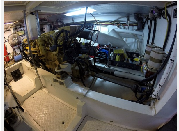
Prima 45 engine room starboard