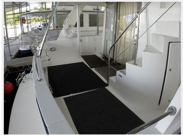
Prima 45 cockpit port