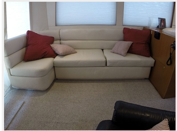
Prima 45 salon port