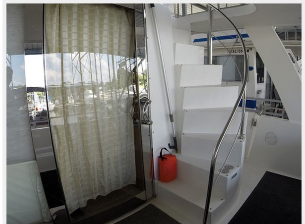
Prima 45 flybridge stairs