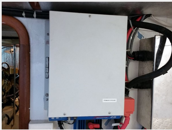
Prima 45 batter charger 2