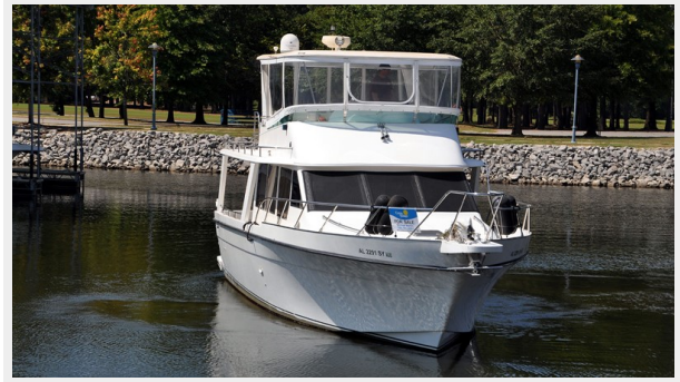
Prima 45 forward profile