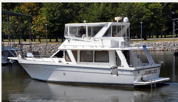
Prima 45 port aft profile