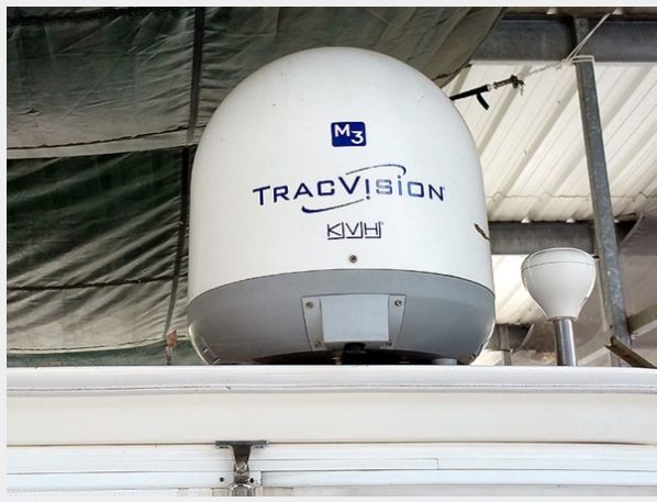
Prima 45 satellite TV