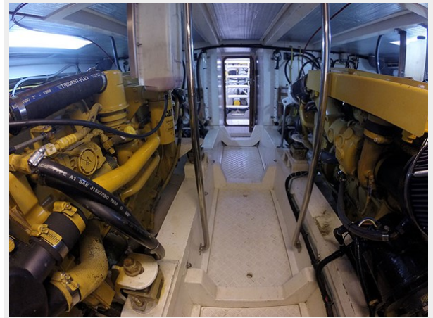
Prima 45 engine room aft