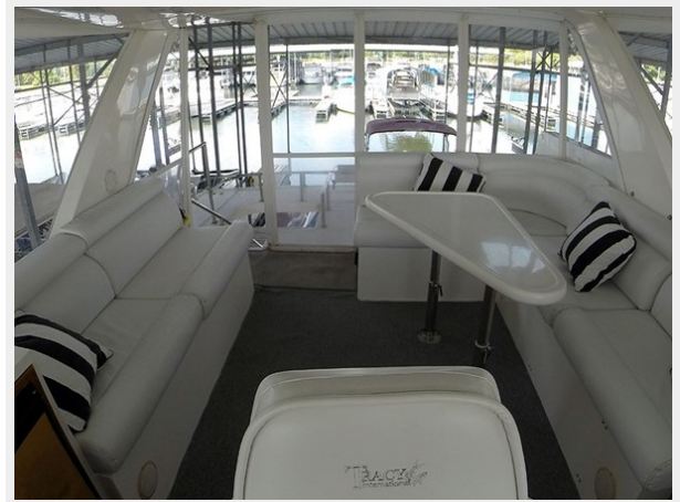
Prima 45 flybridge aft