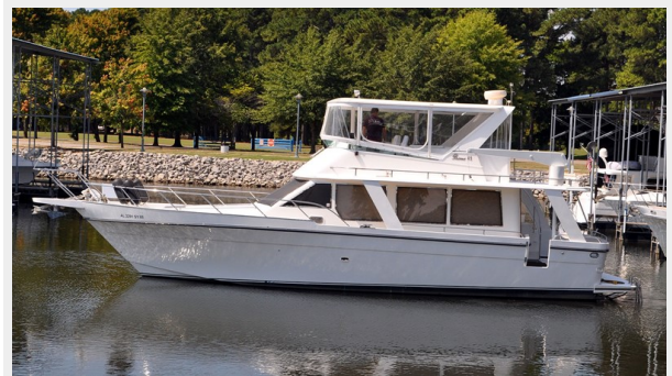
Prima 45 port profile