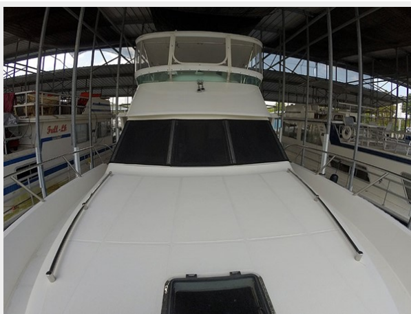
Prima 45 foredeck aft