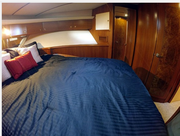
Prima 45 master stateroom starboard