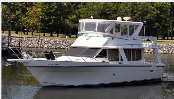
Prima 45 port forward profile