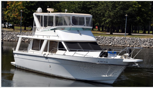
Prima 45 starboard forward profile