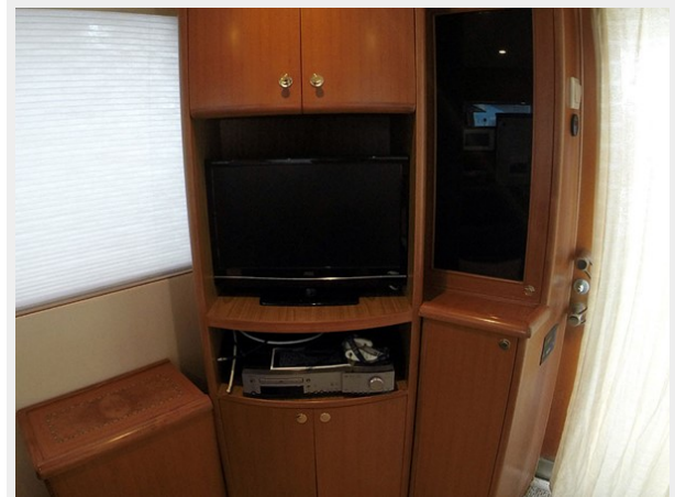
Prima 45 salon entertainment center