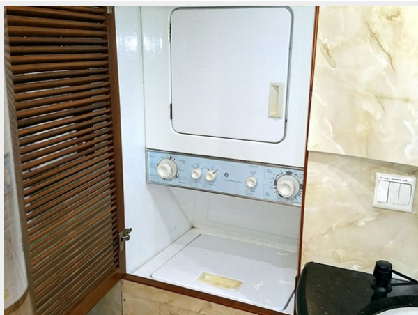
Prima 45 washer & dryer