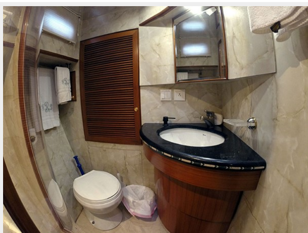
Prima 45 master stateroom head