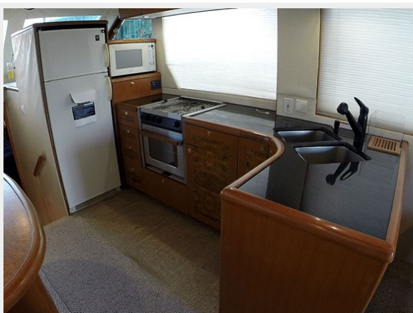
Prima 45 galley