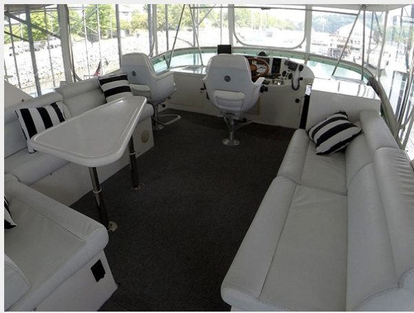
Prima 45 flybridge forward