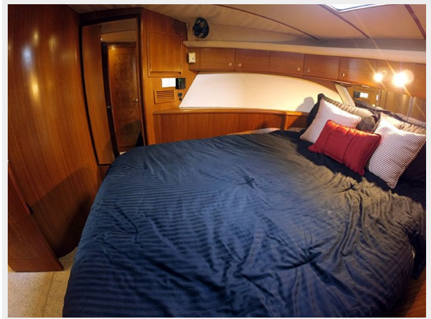
Prima 45 master stateroom port