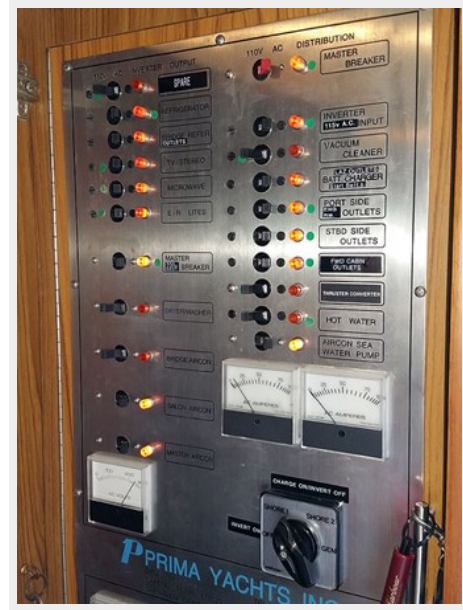
Prima 45 electrical panel2