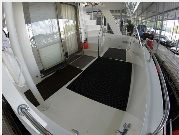
Prima 45 cockpit starboard