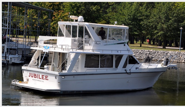
Prima 45 starboard aft profile