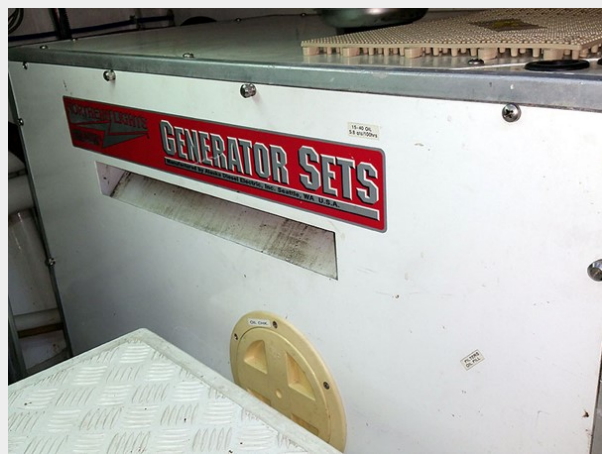
Prima 45 generator