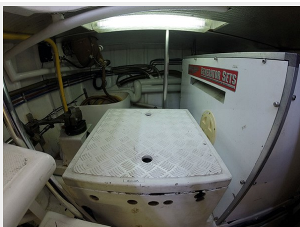
Prima 45 lazarette port