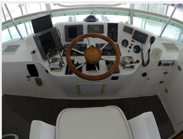
Prima 45 flybridge helm photo1