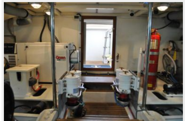
Engine Room Aft View