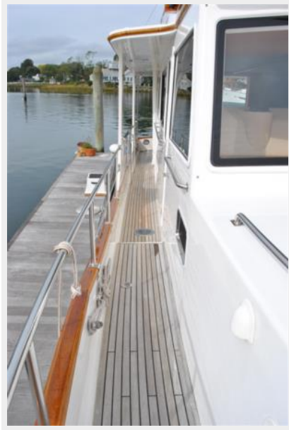
Port Side Deck