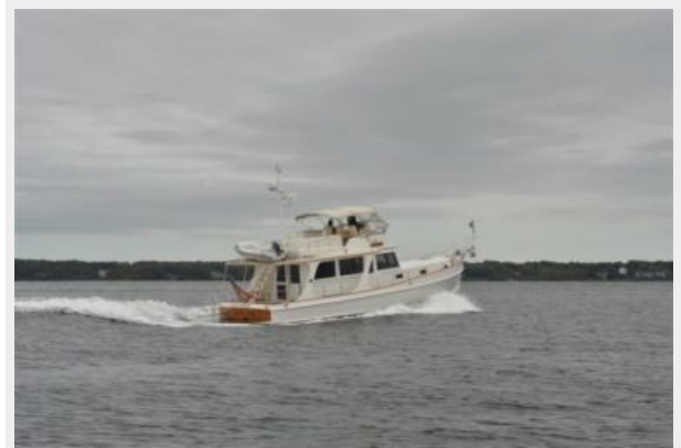
Profile at 16kt Cruise