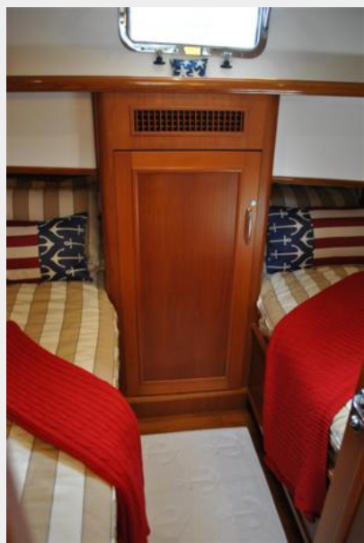
Starboard Guest Cabin