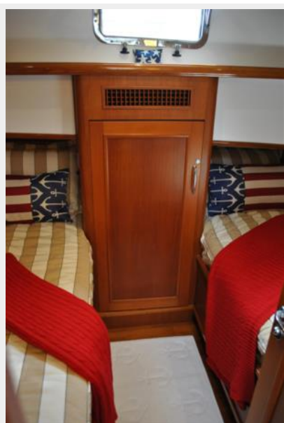
Starboard Guest Cabin