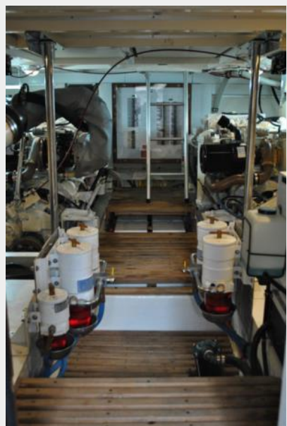
Engine Room Forward View