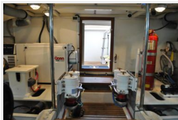
Engine Room Aft View