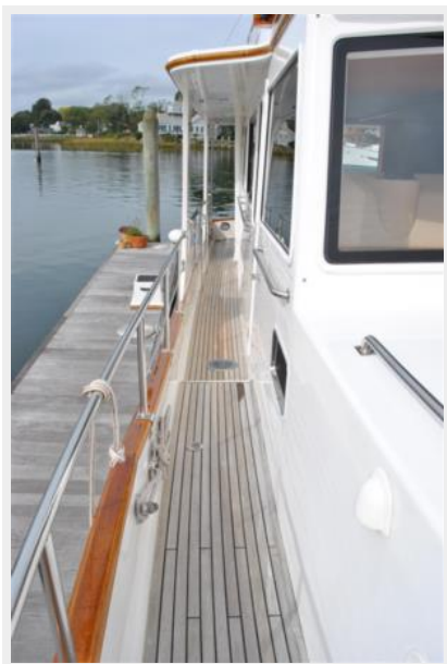
Port Side Deck