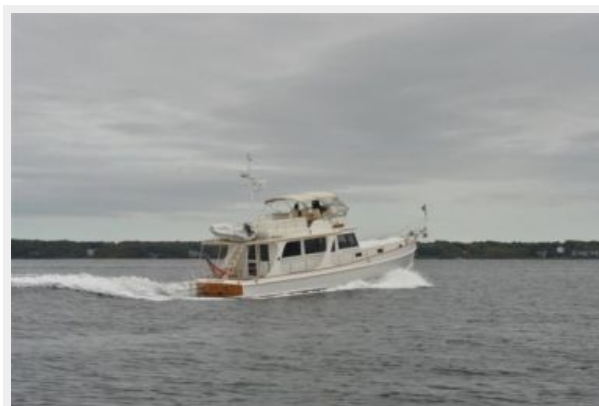
Profile at 16kt Cruise