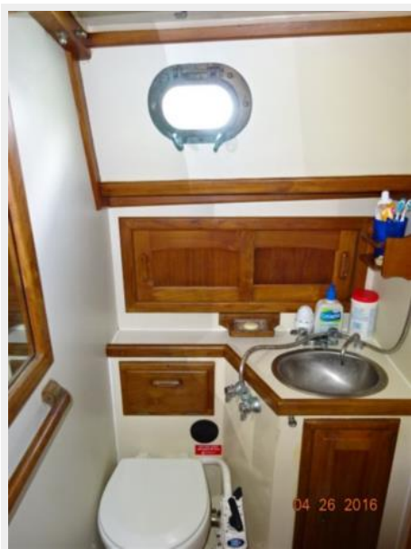
34' Pacific Seacraft head