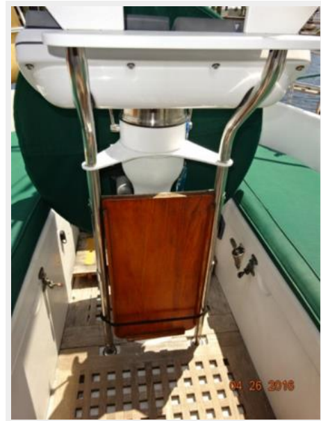
34' Pacific Seacraft cockpit table