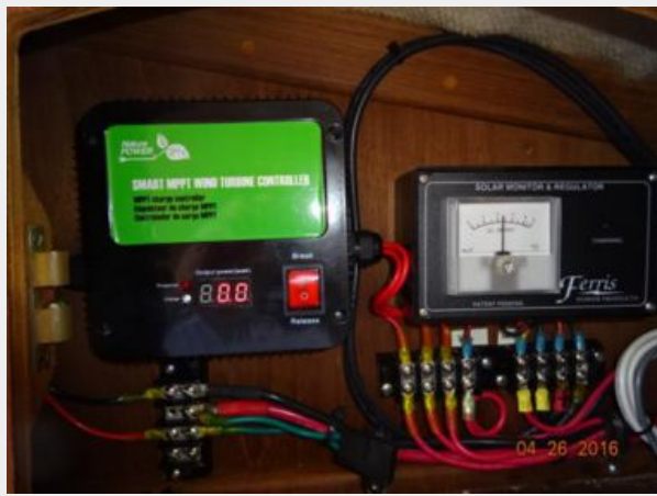
34' Pacific Seacraft electrical panels