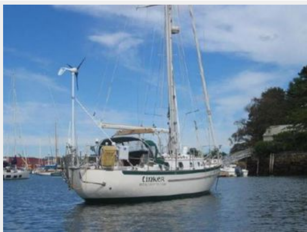
34' Pacific Seacraft starboard aft profile