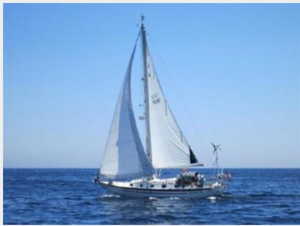
34' Pacific Seacraft underway