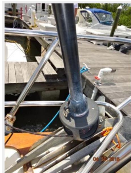
34' Pacific Seacraft roller furler