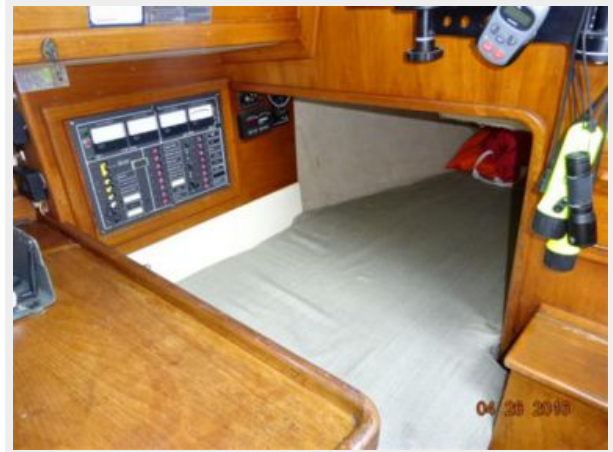
34' Pacific Seacraft quarter berth