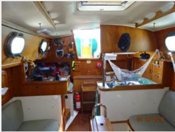
34' Pacific Seacraft salon aft