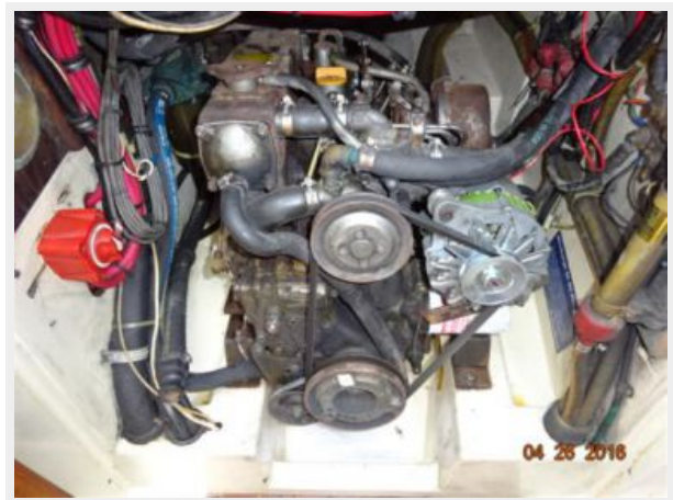
34' Pacific Seacraft auxiliary