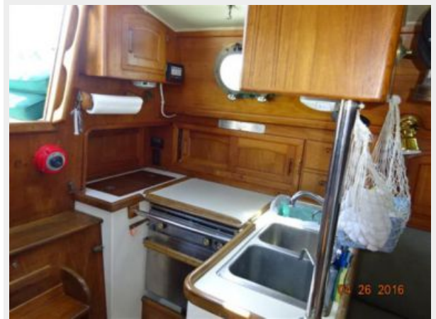
34' Pacific Seacraft galley photo1