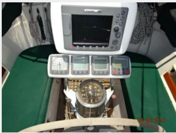
34' Pacific Seacraft cockpit helm