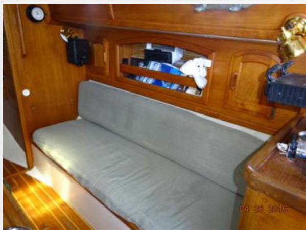
34' Pacific Seacraft salon starboard