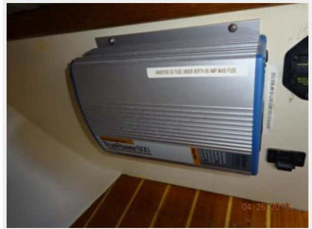
34' Pacific Seacraft inverter