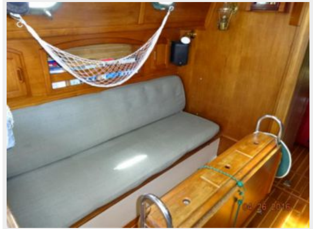
34' Pacific Seacraft salon port