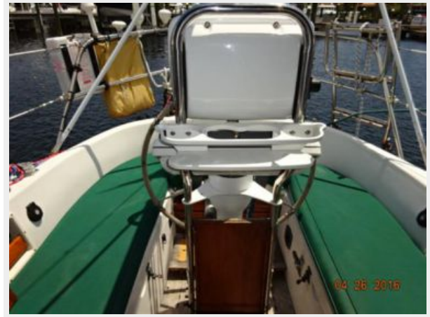
34' Pacific Seacraft cockpit aft