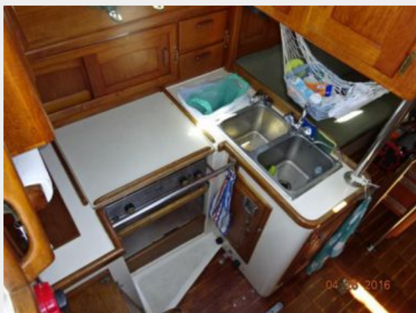
34' Pacific Seacraft galley photo2