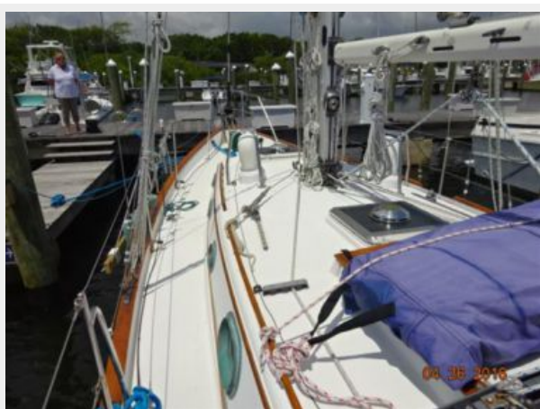
34' Pacific Seacraft foredeck