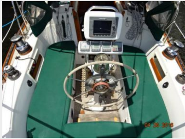
34' Pacific Seacraft cockpit forward