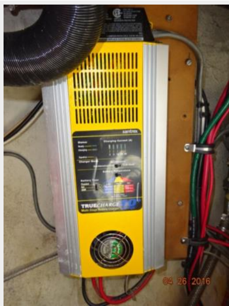
34' Pacific Seacraft battery charger