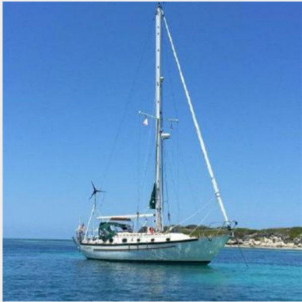
34' Pacific Seacraft starboard forward profile photo1