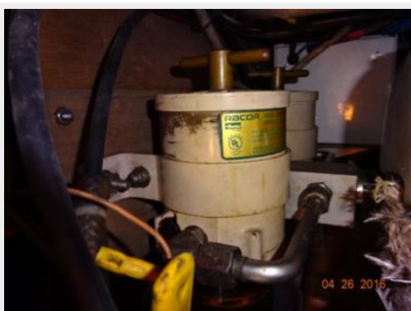
34' Pacific Seacraft Racor fuel filter