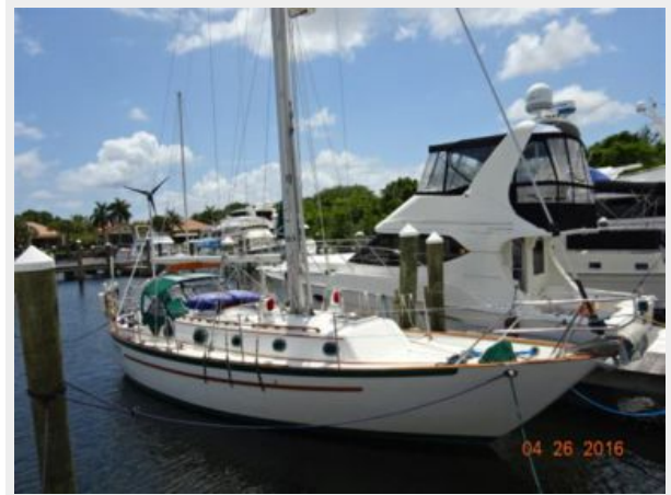
34' Pacific Seacraft starboard forward profile photo2