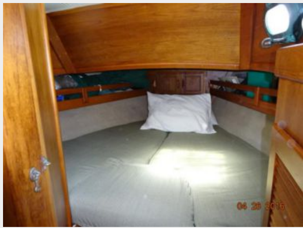
34' Pacific Seacraft master stateroom