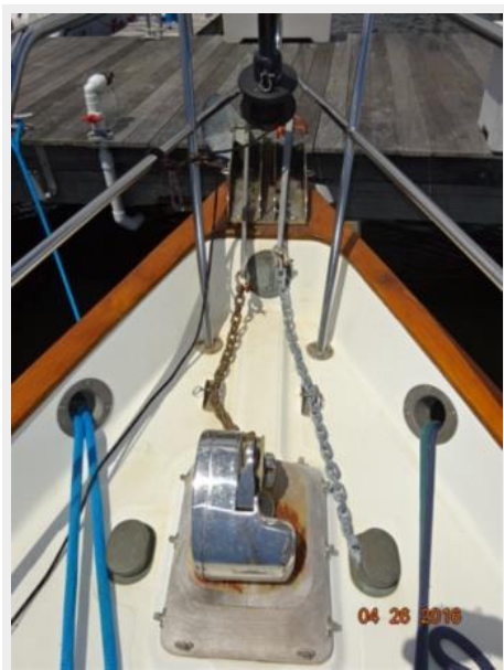
34' Pacific Seacraft anchor windlass