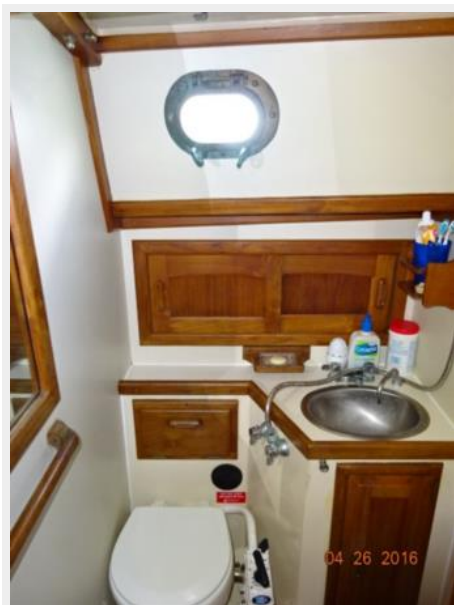
34' Pacific Seacraft head