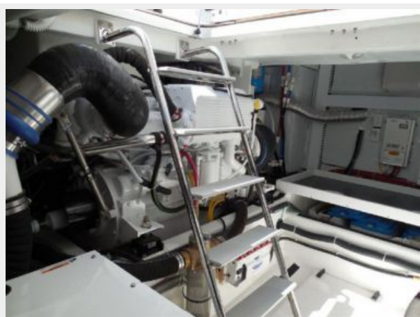
Engine room Access