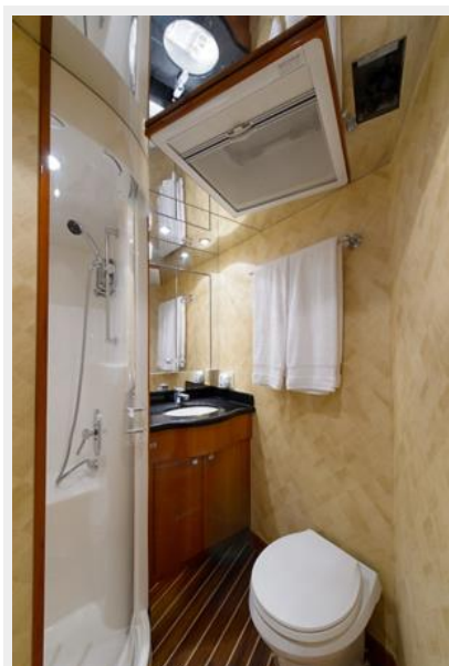
Port Guest Head