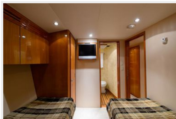
Port Guest Stateroom