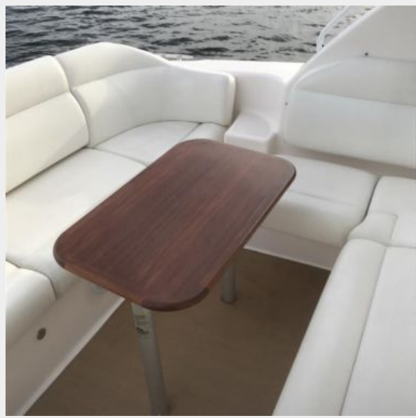
Aft Deck Seating