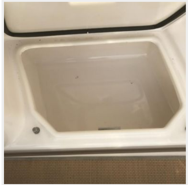
Aft Deck Drink Storage