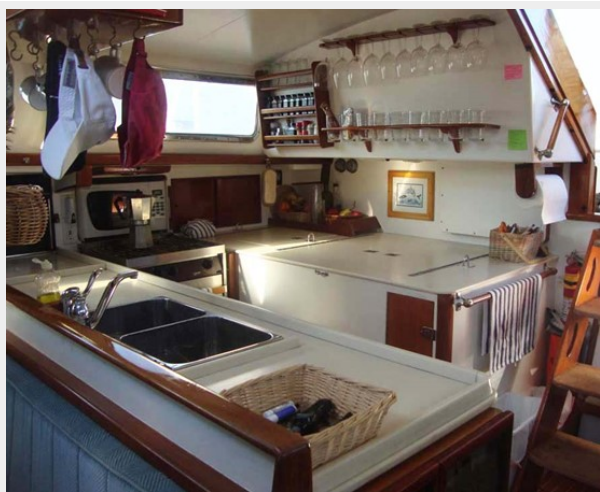
Galley to Aft