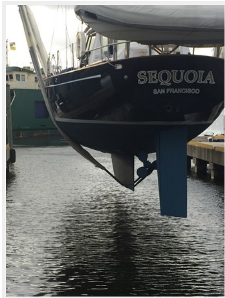
Fresh Bottom Paint, Fall 2016