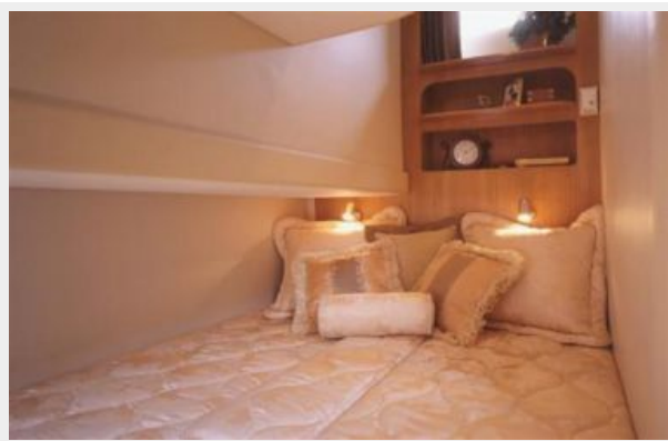
Bed insert seen here, and porthole for natural light.