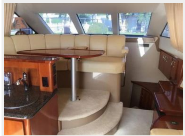
Comfortable seating for five