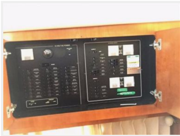
Circuit breakers on std side of salon.