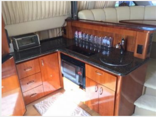
2 Burner glass stove and microwave