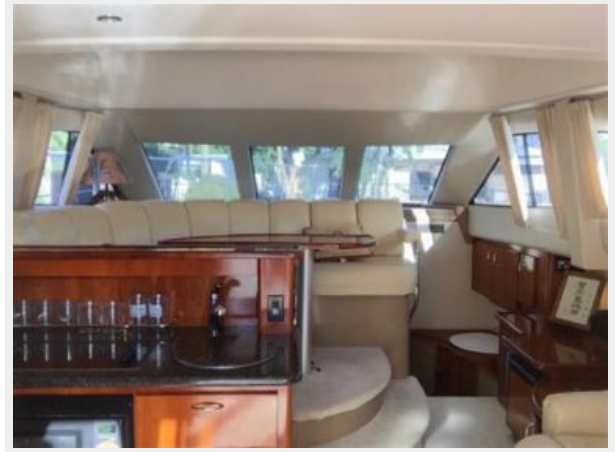
Plenty of headroom throughout