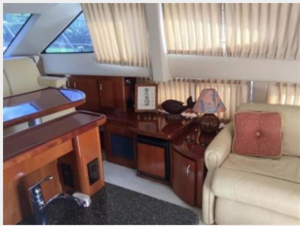
Icemaker and bar to starboard