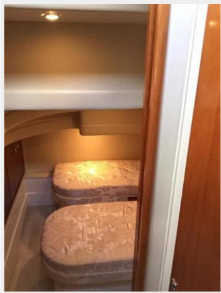
Guest cabin under dinette - Just aft of owner's cabin and head. Head has hallway door as well.