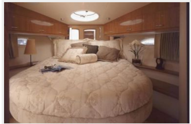
Circular opening hatch above owner's cabin