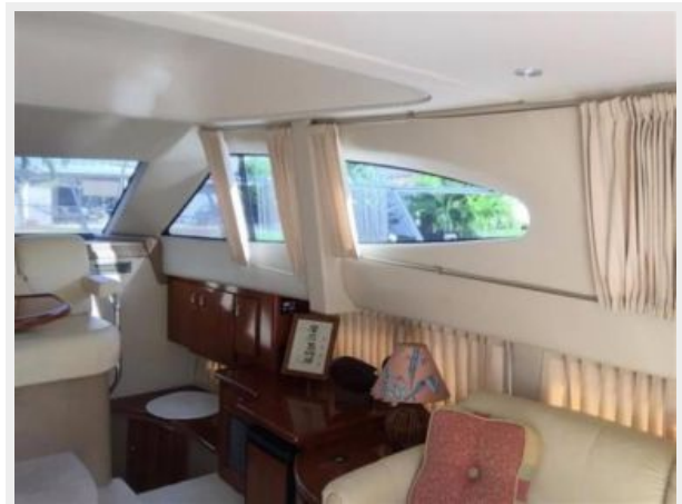
Double tiered windows bring in a lot of natural light.