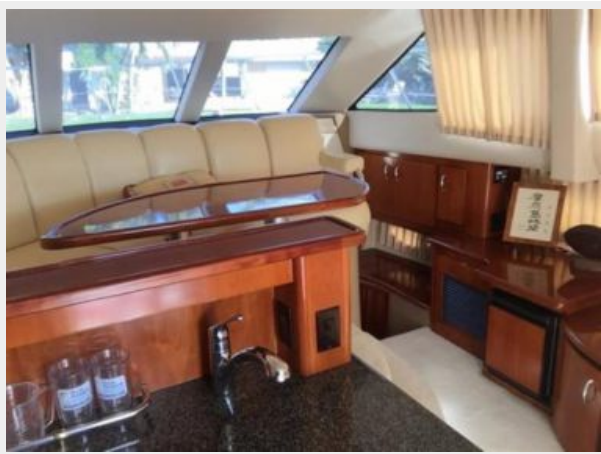
Raised dinette offers expansive views