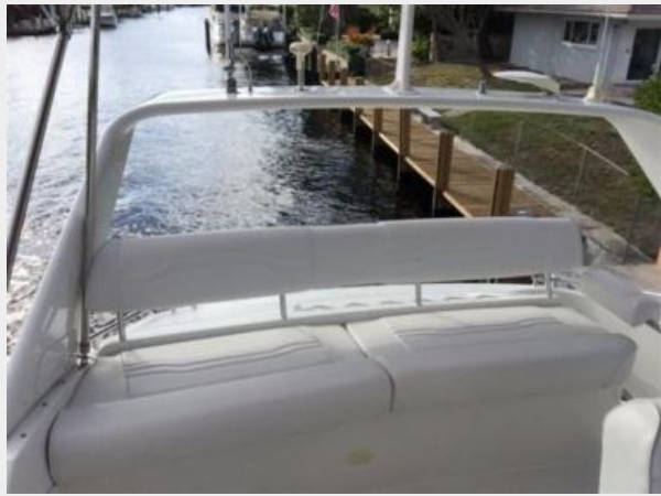
Great visibility aft from the helm.