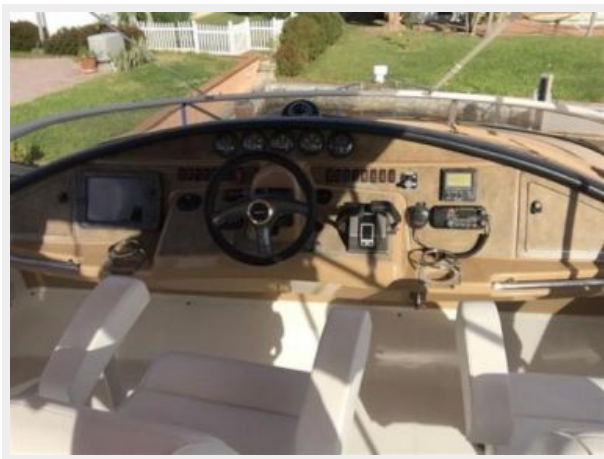
New vinyl upholstery