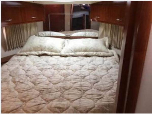
Owner's cabin at bow