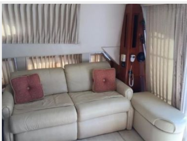
Sleeper sofa and ottoman. - Remote VHF mic seen in corner