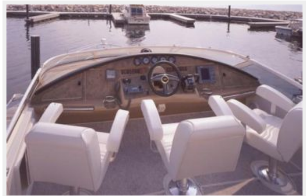
Three captain's chairs at the helm