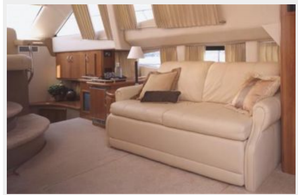
Manufacturer Provided Image - Sleeper sofa turns into Queen bed