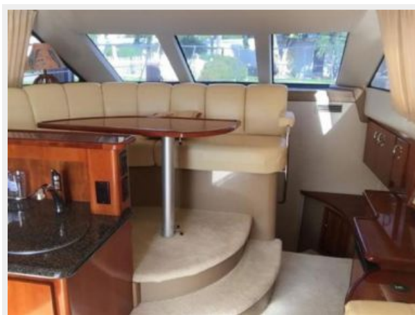
Comfortable seating for five