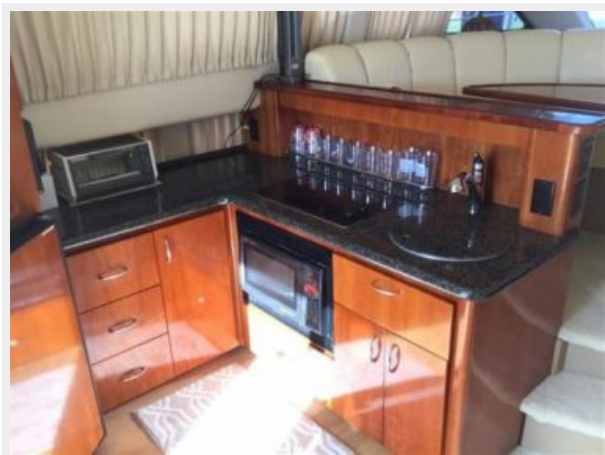
2 Burner glass stove and microwave