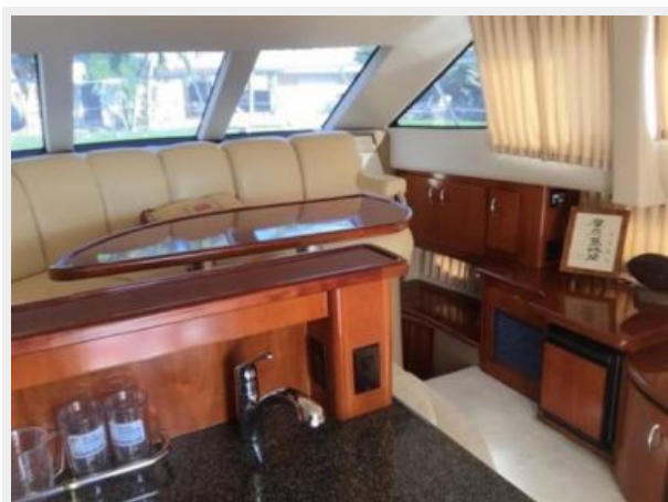
Raised dinette offers expansive views