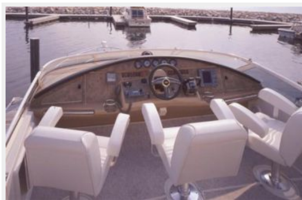
Manufacturer Provided Image - Three captain's chairs at the helm