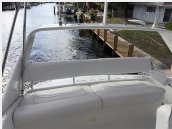
Great visibility aft from the helm.