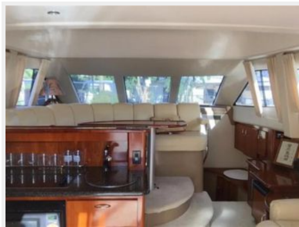
Plenty of headroom throughout