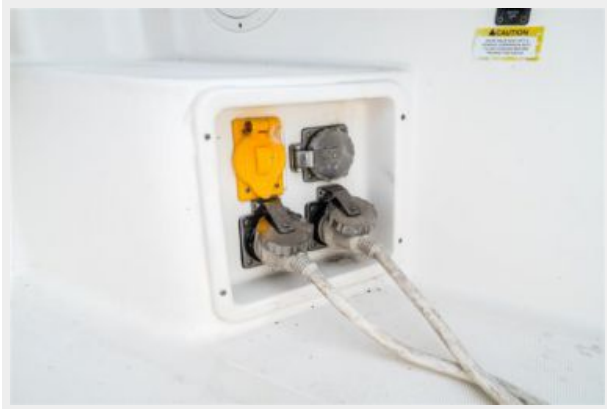
Shorepower/Electric Reel Outlet