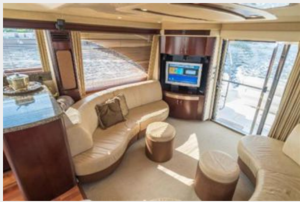
Salon looking aft