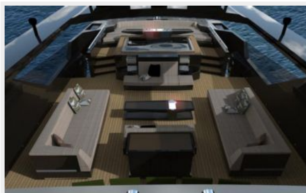
Sundeck - seating area