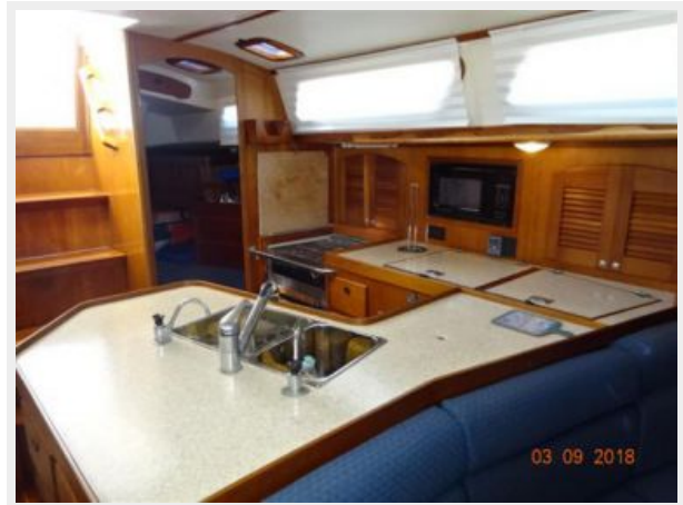
Fidelio galley2 3-9-18