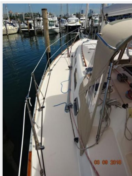
Fidelio port side deck1 3-9-18