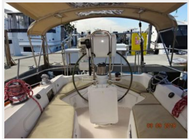
Fidelio cockpit aft1 3-9-18