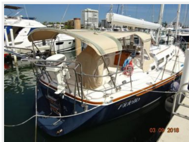
Fidelio stbd aft profile 3-9-18