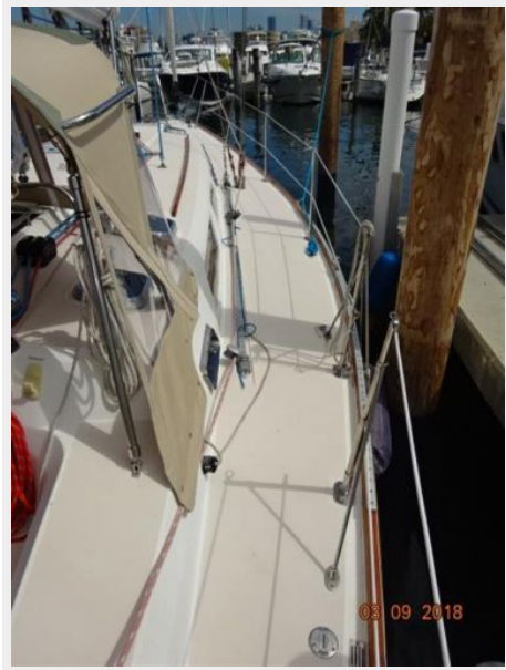
Fidelio stbd side deck1 3-9-18