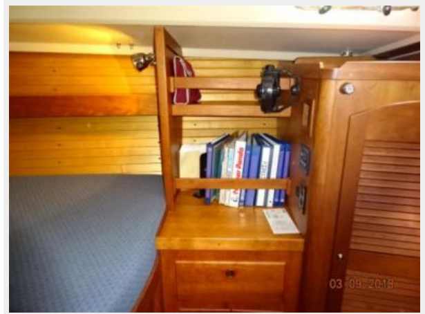
Fidelio fwd stateroom stbd 3-9-18