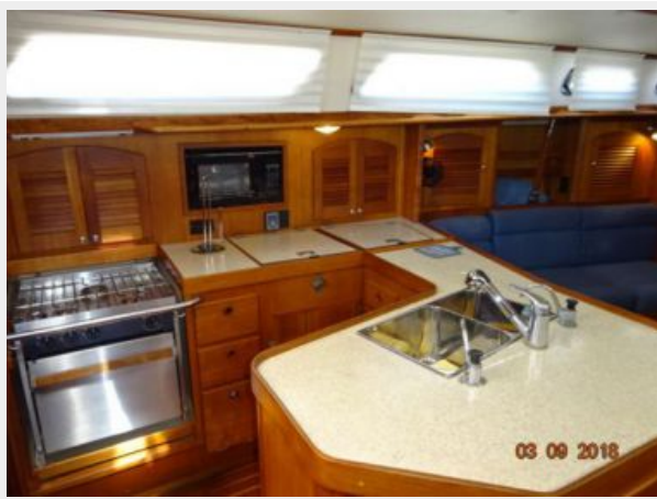
Fidelio galley1 3-9-18