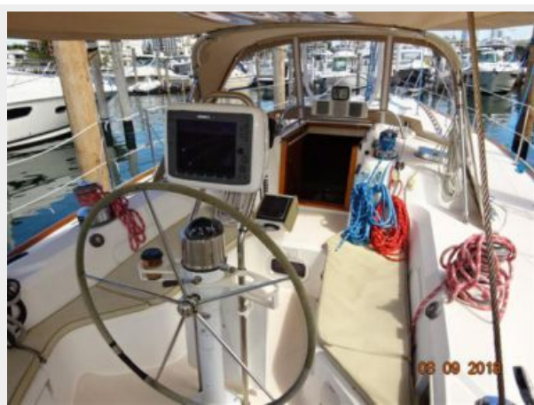
Fidelio cockpit fwd1 3-9-18