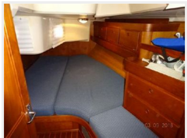
Fidelio aft stateroom 3-9-18