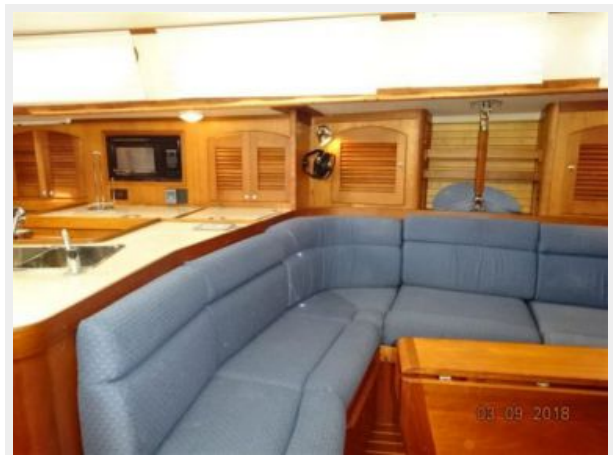
Fidelio salon port 3-9-18