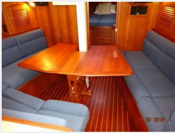
Fidelio salon table 11-29-16