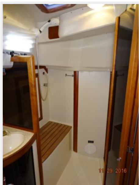
40' Sabre shower