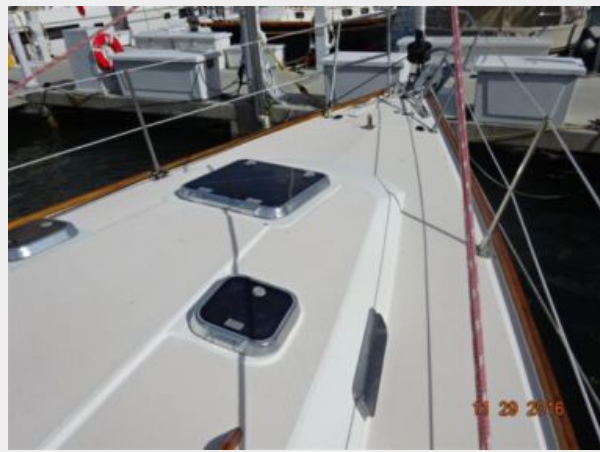
40' Sabre foredeck photo1