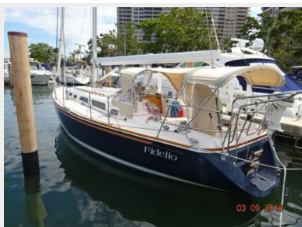
Fidelio port aft profile 3-9-18