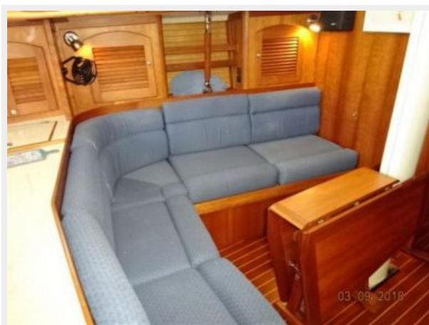
Fidelio salon port seating 3-9-18