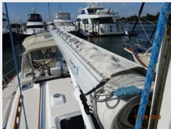
40' Sabre in-boom furling mainsail