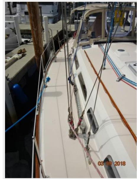
Fidelio stbd side deck2 3-9-18