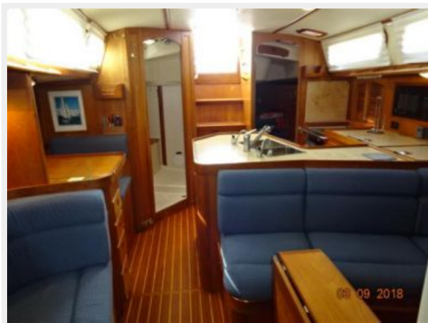
Fidelio salon aft 3-9-18