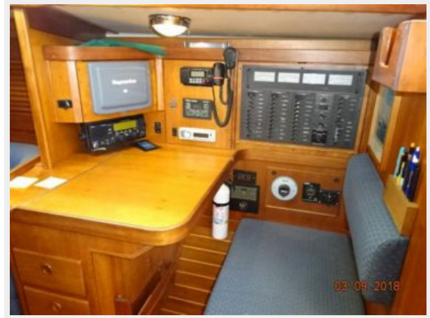
Fidelio nav station 3-9-18