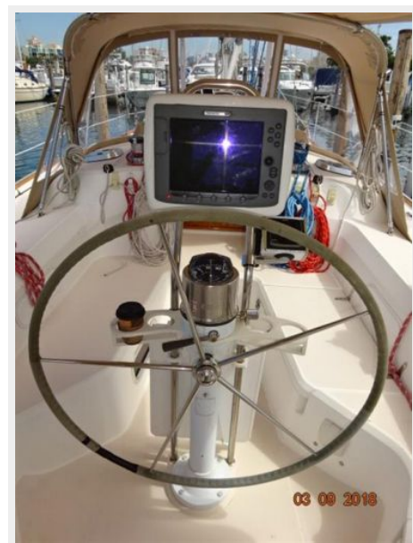
Fidelio cockpit helm1 3-9-18