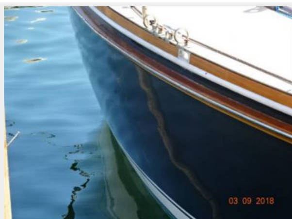
Fidelio port hullside 3-9-18