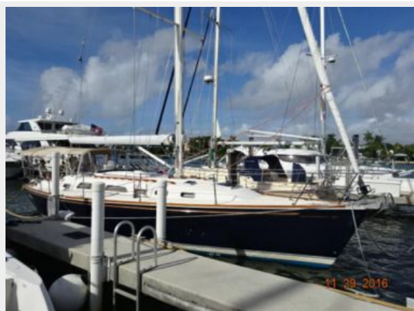
40' Sabre starboard forward profile photo1