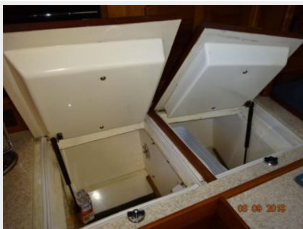
Fidelio refrigeration 3-9-18