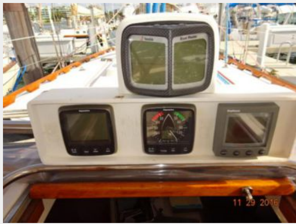
40' Sabre cockpit forward electronics