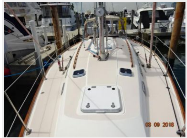
Fidelio foredeck aft 3-9-18