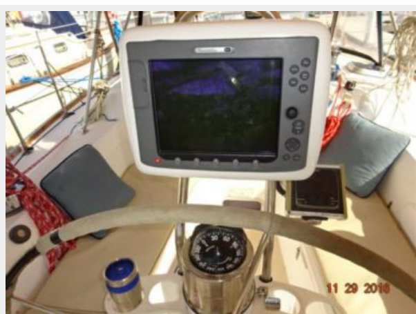
Fidelio cockpit helm MFD 11-29-16