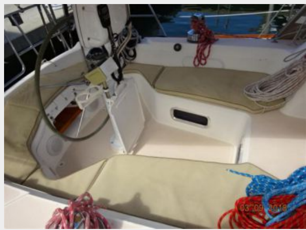
Fidelio cockpit 3-9-18