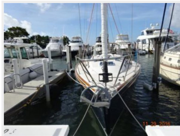
40' Sabre forward profile