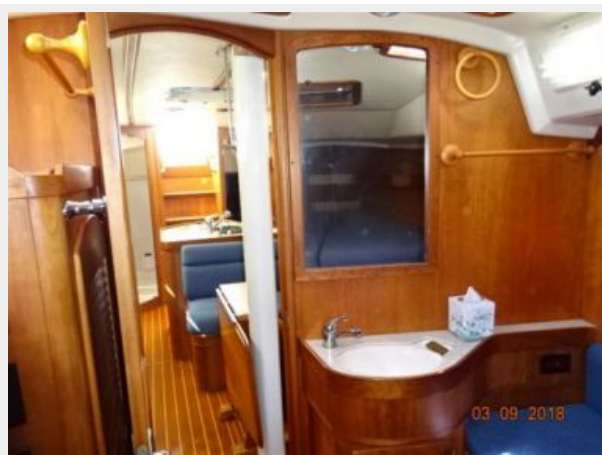
Fidelio fwd stateroom aft 3-9-18