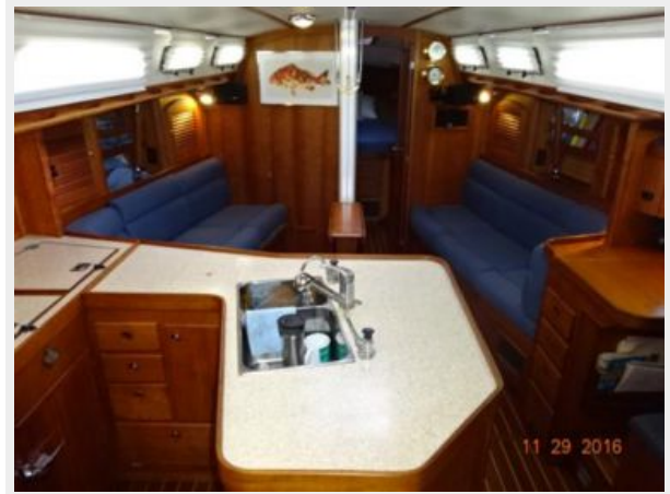
40' Sabre salon forward