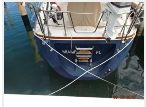
Fidelio swimplatform 3-9-18