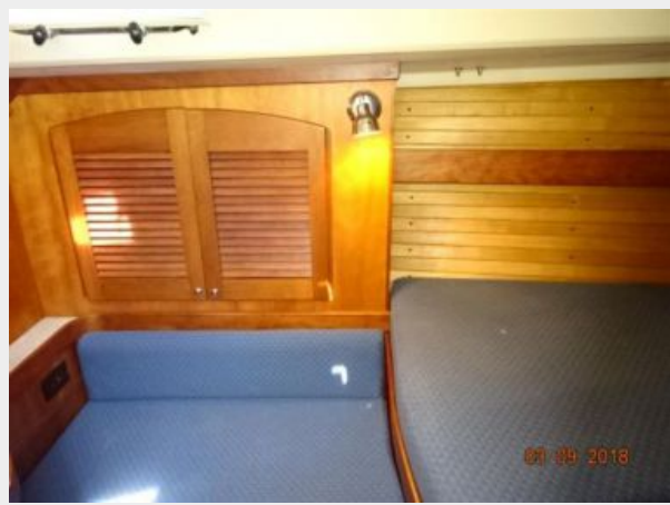
Fidelio fwd stateroom 3-9-18