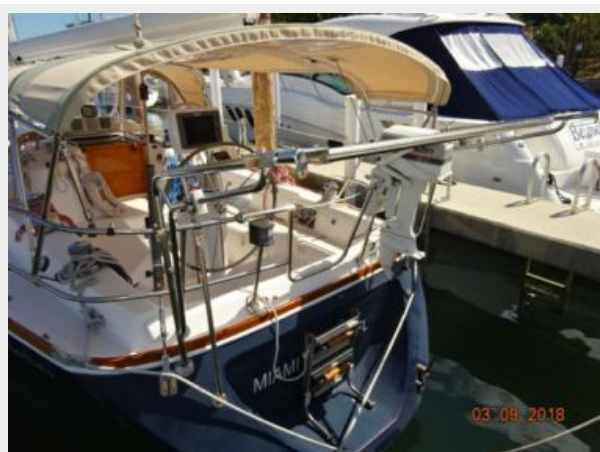
Fidelio tender davits 3-9-18