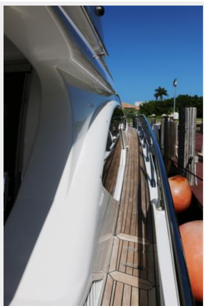
Teak Walk Decks