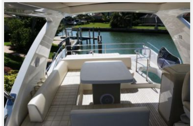
Flybridge Seating Aft