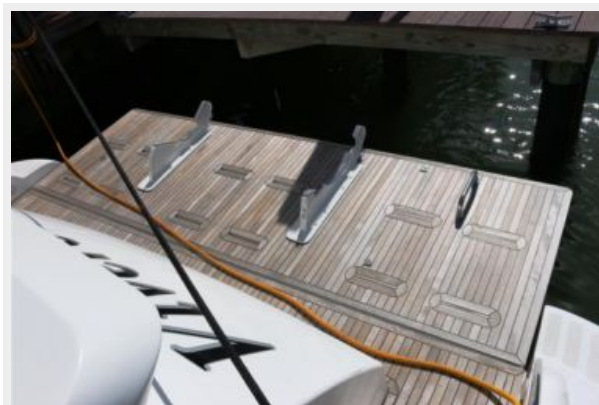
Hydraulic Swim Platform