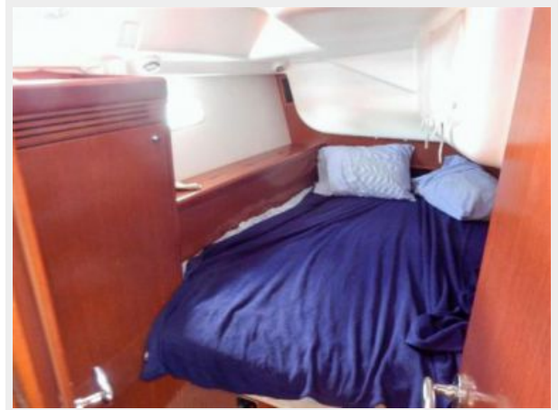
Aft Cabin- Starbd