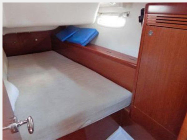
Aft Cabin - Portside