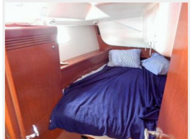
Aft Cabin- Starbd