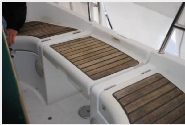
drop down seat