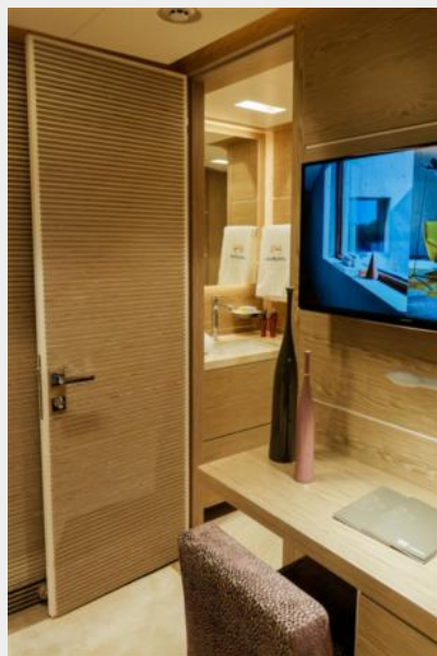
Port Twin Guest