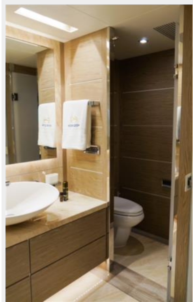
Ensuite Starboard VIP Head