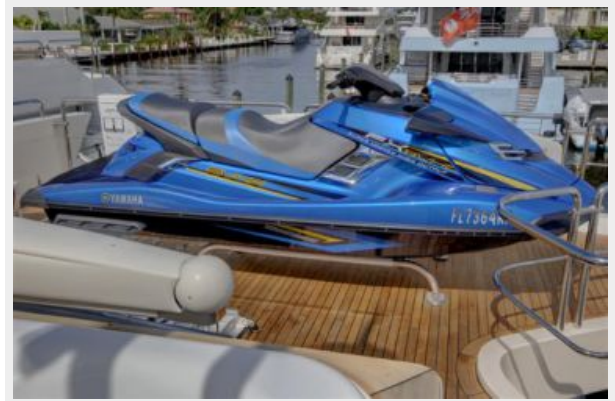
Stainless steel rub rail