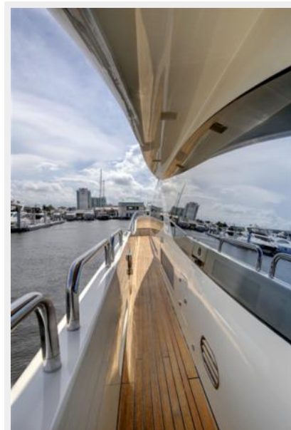
Stainless steel rub rail