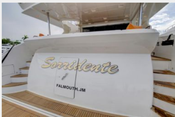
Swim platform on transom