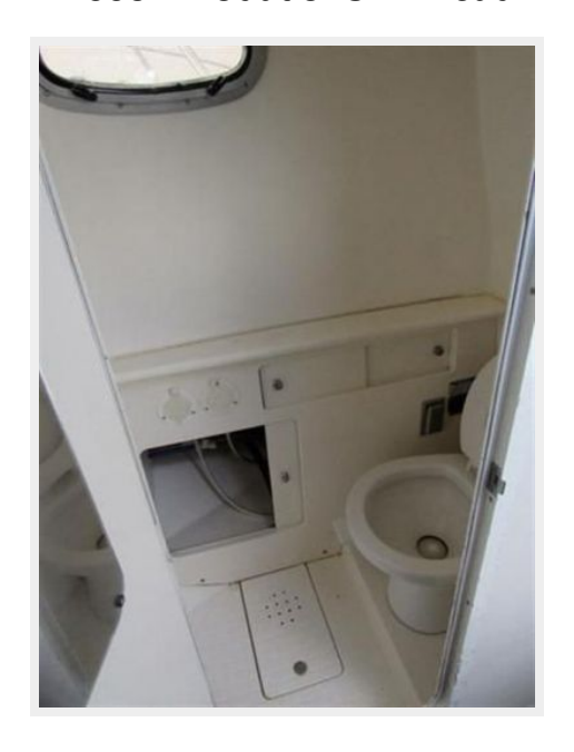
Accommodations 2 - Head