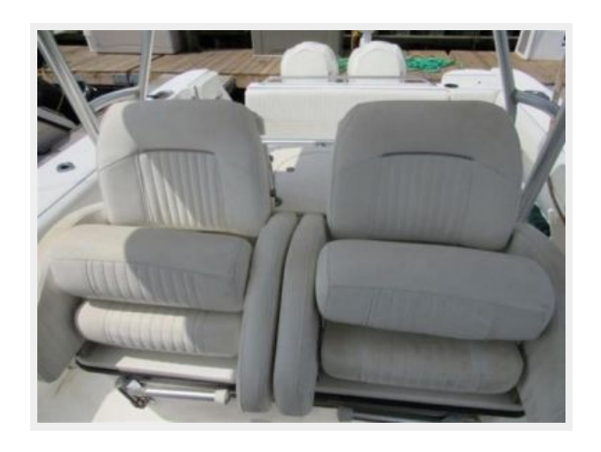
Deck 4 - Helm Seats