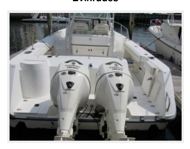
Engine & Mechanical Equipment - Evinrudes