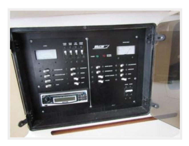
Electrical System / Equipment - Electrical Panel