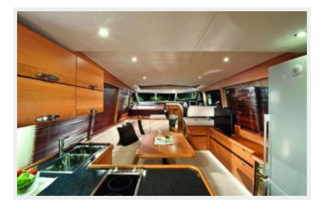
Greenline Hybrid 40 Saloon Seating