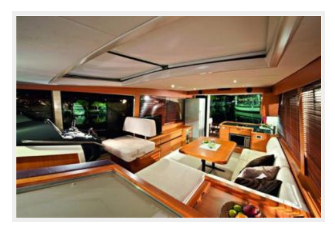
Manufacturer Provided Image: Greenline Hybrid 40 Galley