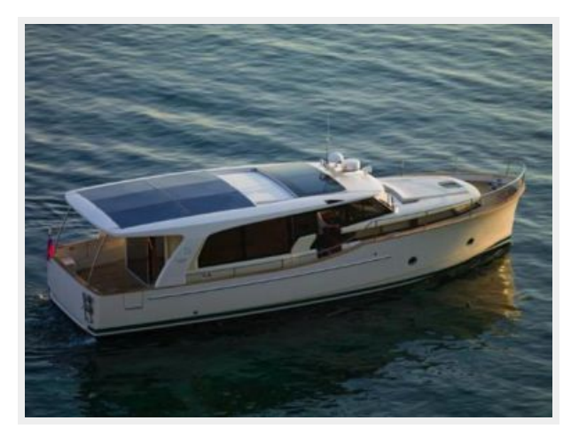
Manufacturer Provided Image: Greenline Hybrid 40 Bow