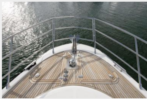
64' Azimut - Bow