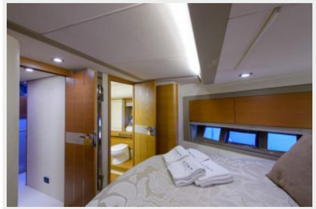
64' Azimut - Stateroom