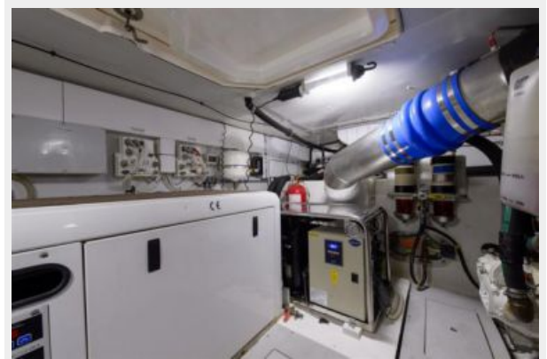
64' Azimut - Engine Room 5