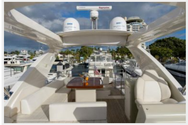
64' Azimut - Top Deck