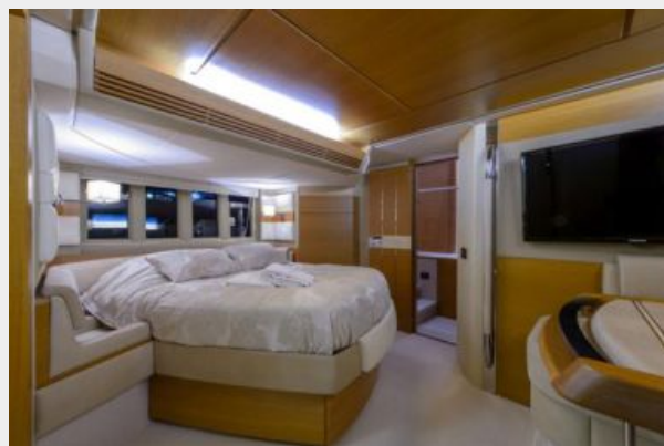
64' Azimut - Stateroom