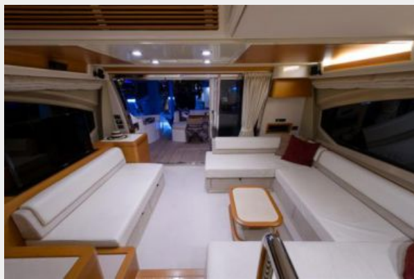
64' Azimut - Salon