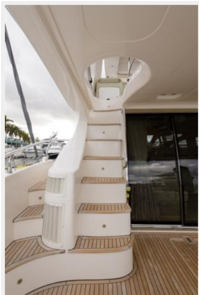
64' Azimut - Stairs to top deck