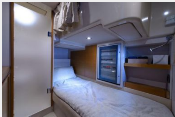
64' Azimut - Crew Quarters