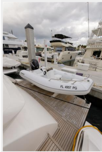
64' Azimut - Dinghy 1