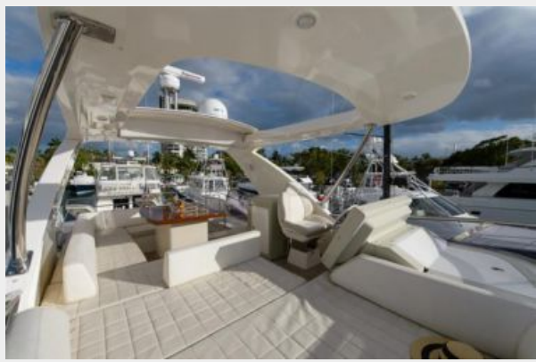
64' Azimut - Top Deck