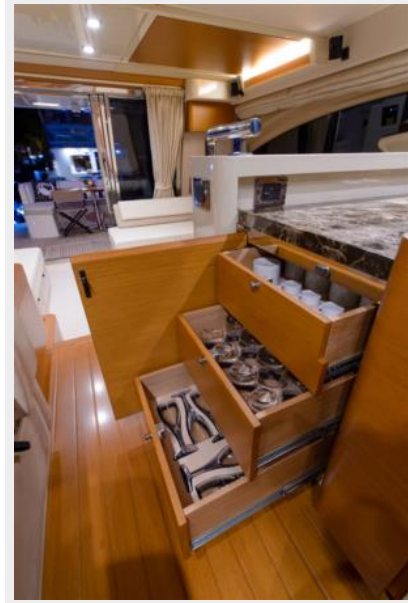
64' Azimut - Galley