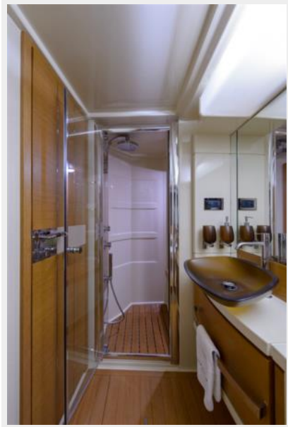
64' Azimut - Head