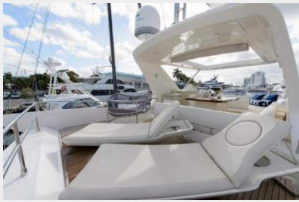
64' Azimut - Chaise Lounges