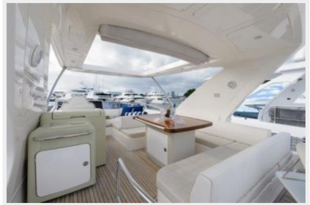
64' Azimut - Outdoor Seating Area