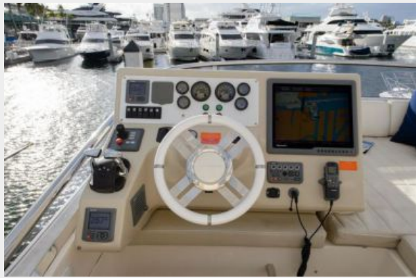
64' Azimut - Helm