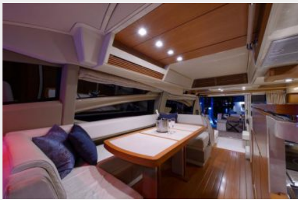
64' Azimut - Salon