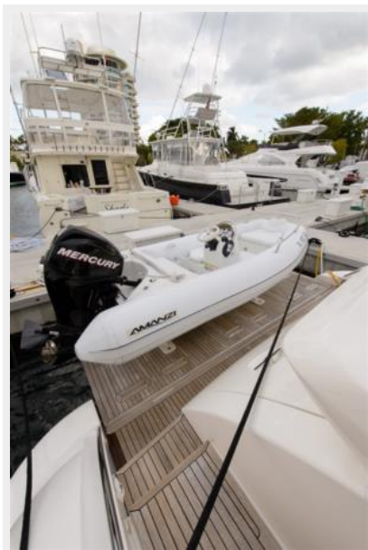
64' Azimut - Dinghy 3