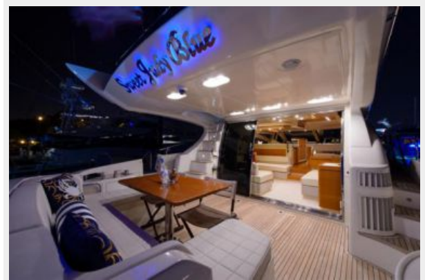
64' Azimut - Cockpit