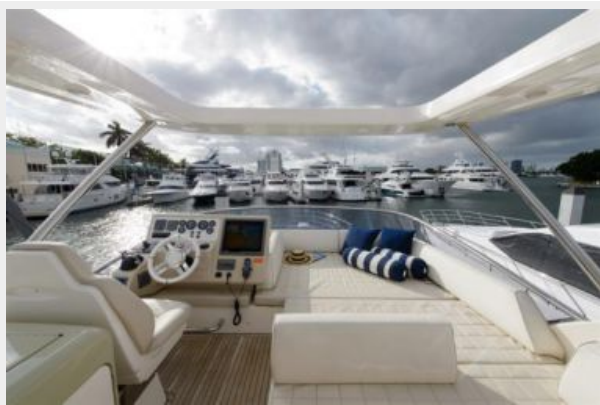
64' Azimut - Helm