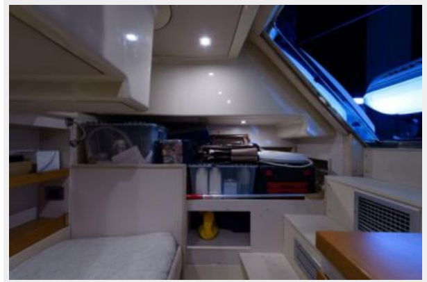
64' Azimut - Extra Storage