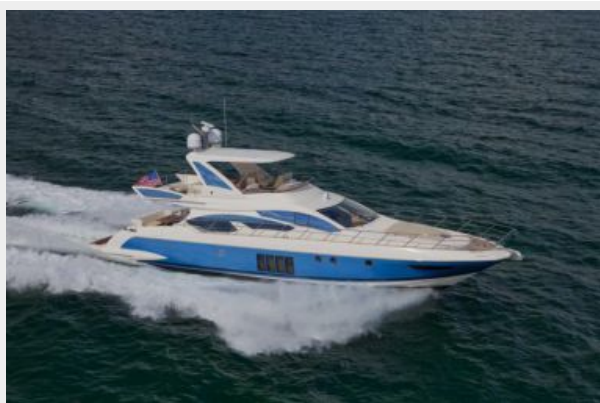
64' Azimut - Starboard Profile