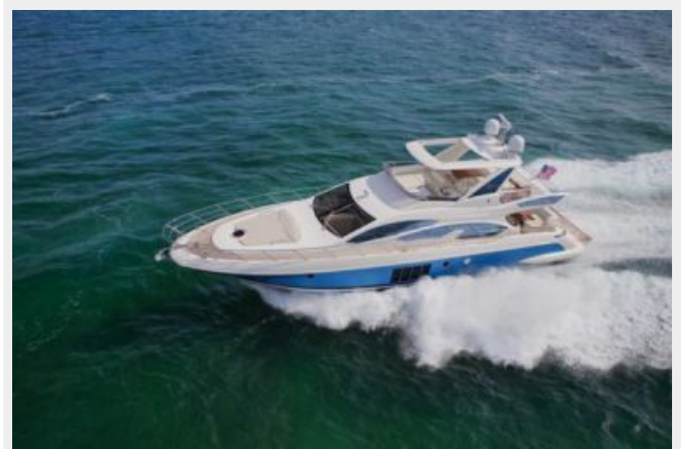
64' Azimut - Profile Picture 3