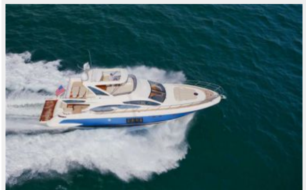
64' Azimut - Profile Picture