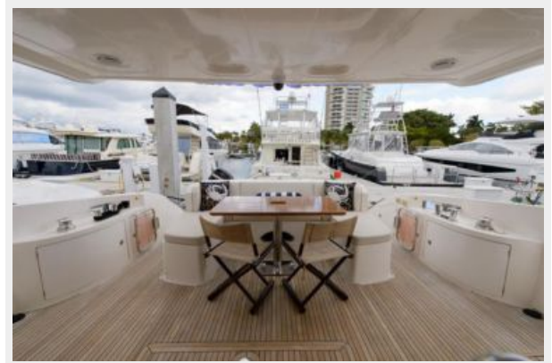
64' Azimut - Cockpit