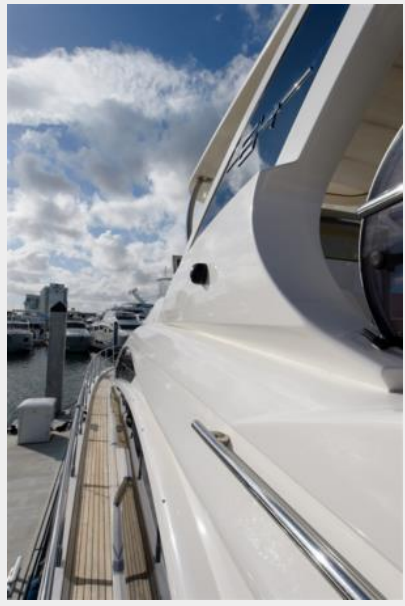
64' Azimut - Walk Around