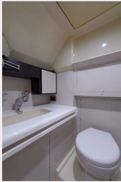
64' Azimut - Head