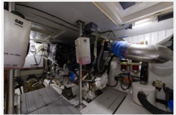
64' Azimut - Engine Room 3