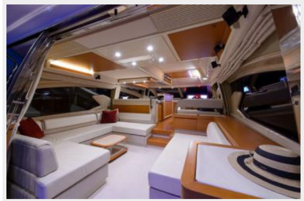
64' Azimut - Salon