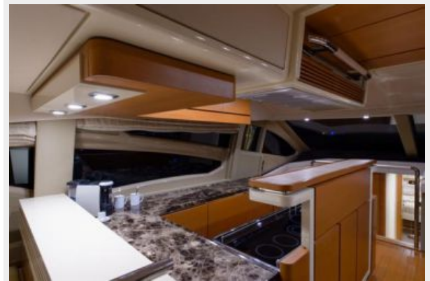
64' Azimut - Galley