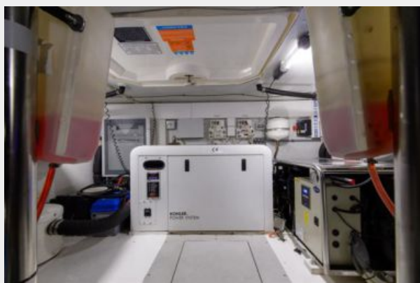
64' Azimut - Engine Room 4