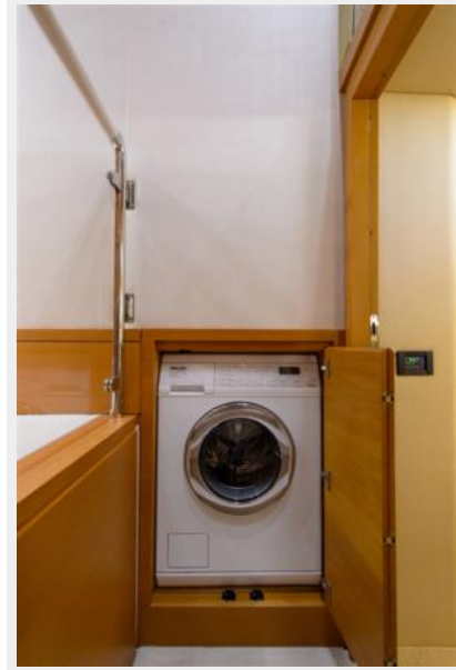
64' Azimut - Washer