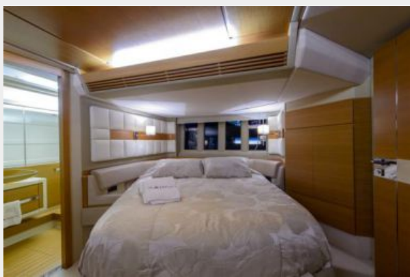
64' Azimut - Stateroom