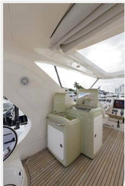
64' Azimut - Insulated Coolers