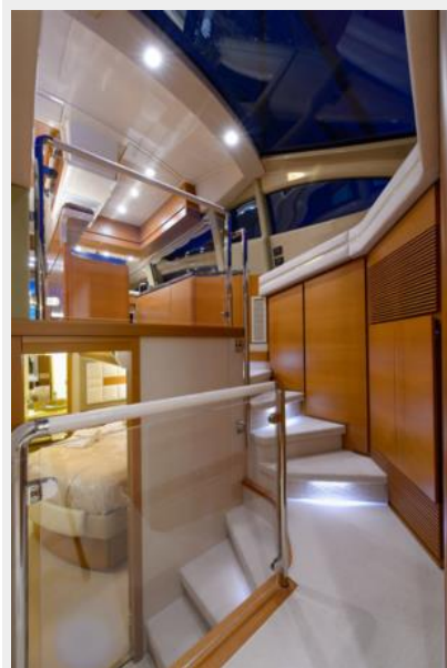
64' Azimut - Stairwell