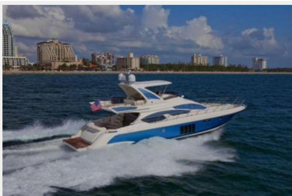
64' Azimut - Profile Picture