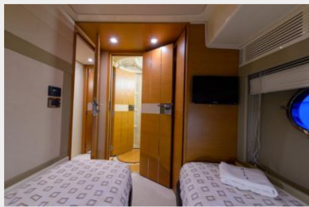
64' Azimut - Stateroom