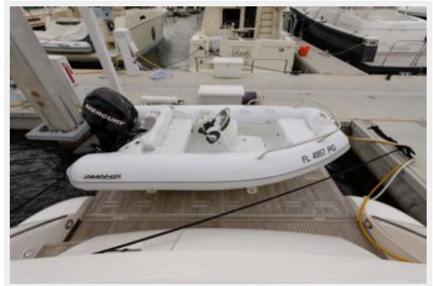
64' Azimut - Dinghy 2