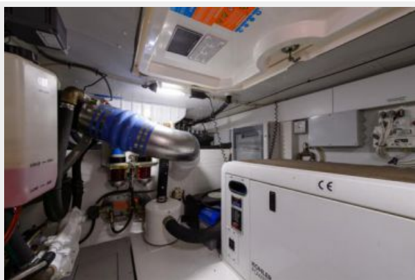
64' Azimut - Engine Room 6