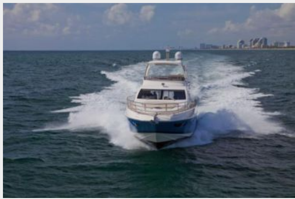
64' Azimut - Bow Profile