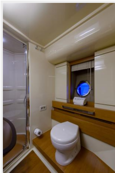
64' Azimut - Head