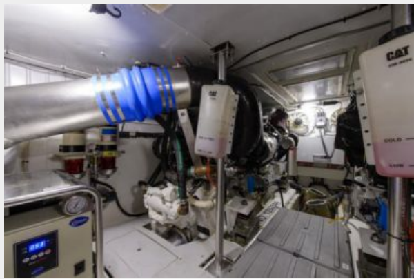
64' Azimut - Engine Room 2