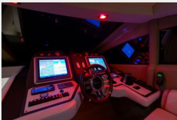
64' Azimut - Helm