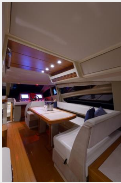
64' Azimut - Salon