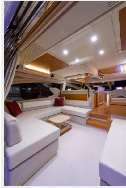
64' Azimut - Salon