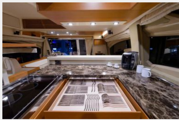
64' Azimut - Galley