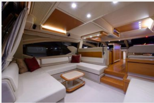
64' Azimut - Salon