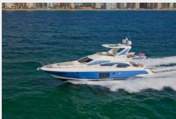
64' Azimut - Profile Picture 2