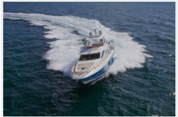
64' Azimut - Profile Picture 1