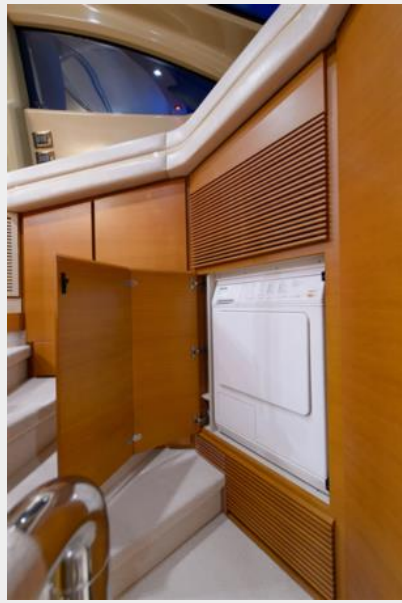
64' Azimut - Dryer