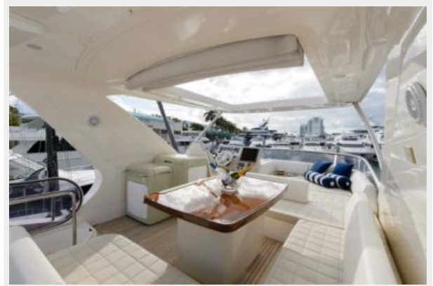
64' Azimut - Outdoor Seating