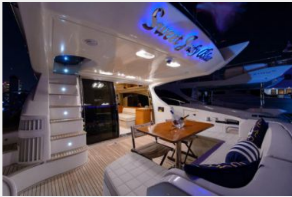
64' Azimut - Cockpit