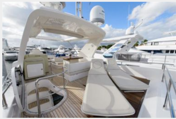
64' Azimut - Chaise Lounges