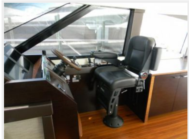
Tiara 50 Flybridge Helm