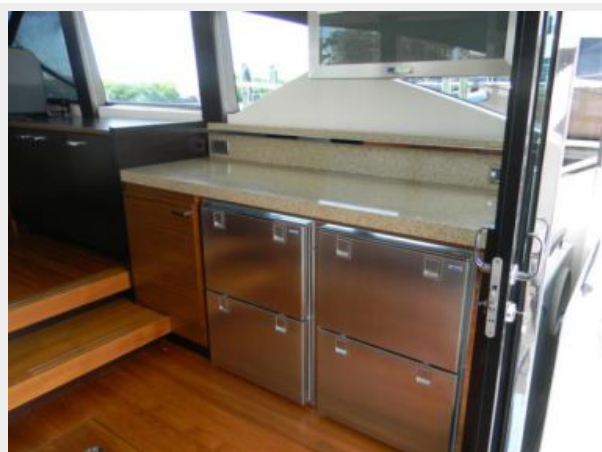
Tiara 50 Flybridge Galley