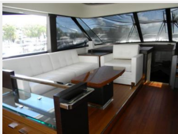
Tiara 50 Flybridge Salon