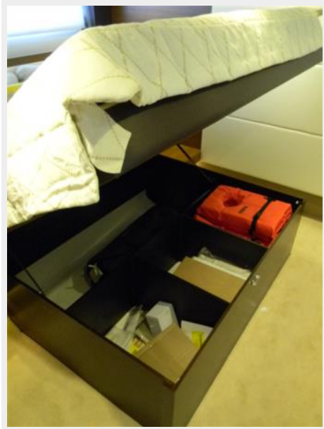
Tiara 50 Flybridge Master Stateroom