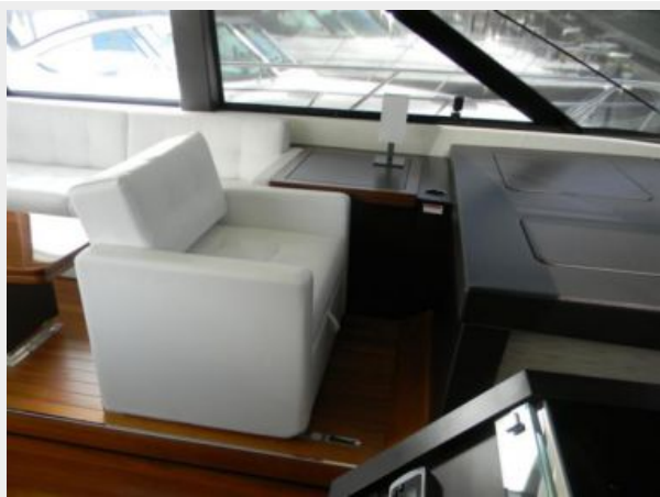
Tiara 50 Flybridge Salon