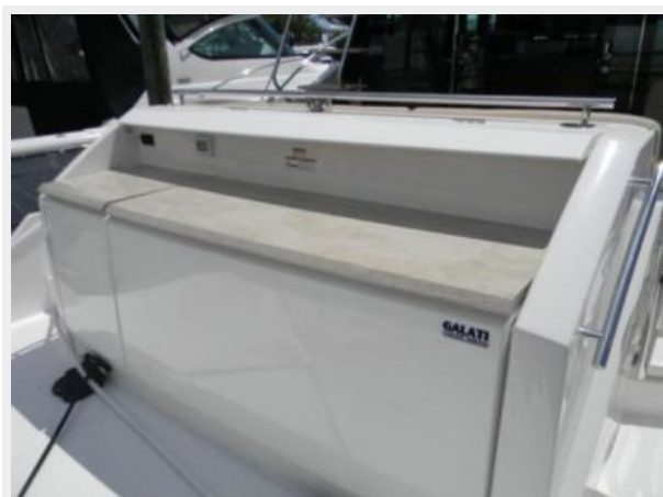
Tiara 50 Flybridge Transom