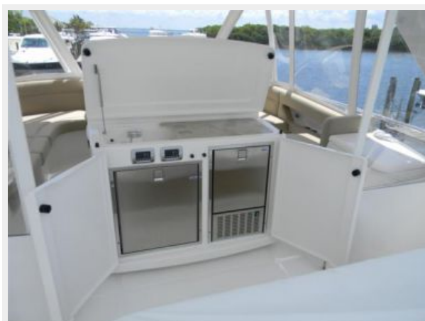
Tiara 50 Flybridge - Flybridge Wetbar