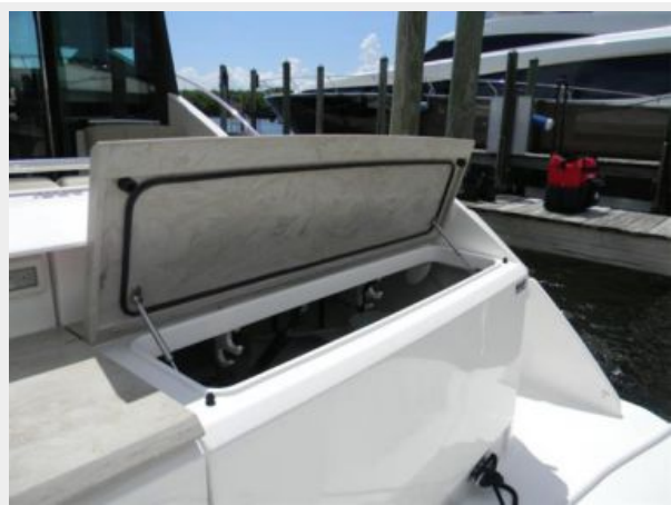
Tiara 50 Flybridge Transom Storage