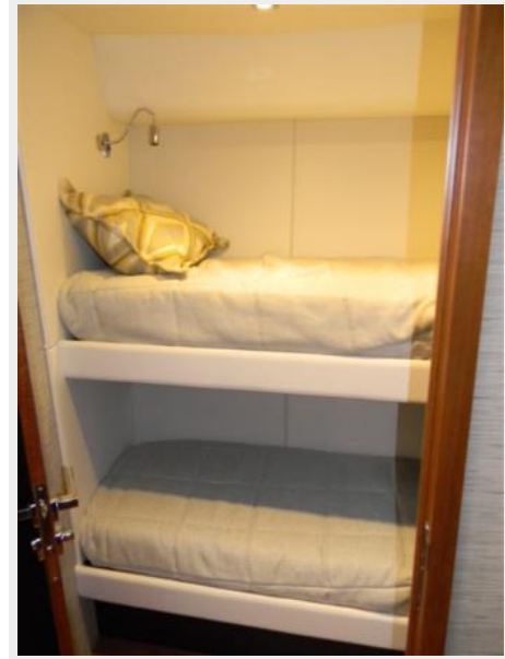
Tiara 50 Flybridge Third Guest Stateroom