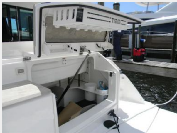
Tiara 50 Flybridge Transom Storage