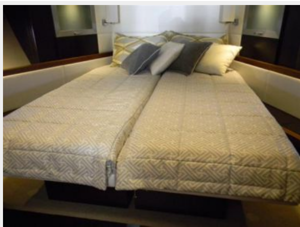
Tiara 50 Flybridge Forward Stateroom