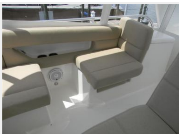
Tiara 50 Flybridge - Flybridge Seating