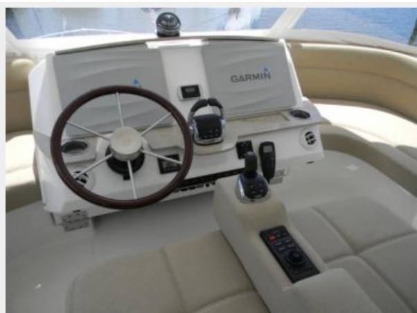
Tiara 50 Flybridge Upper Helm