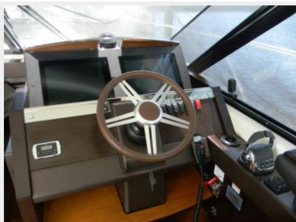
Tiara 50 Flybridge Helm