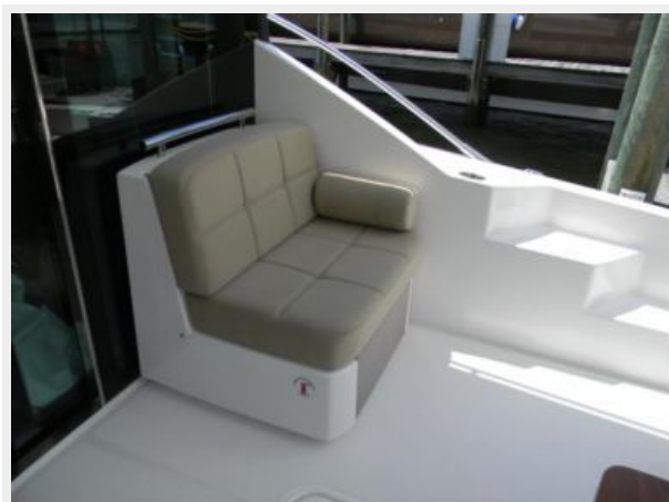
Tiara 50 Flybridge Cockpit