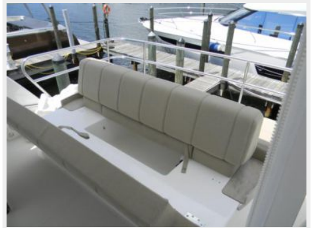
Tiara 50 Flybridge - Flybridge Seating