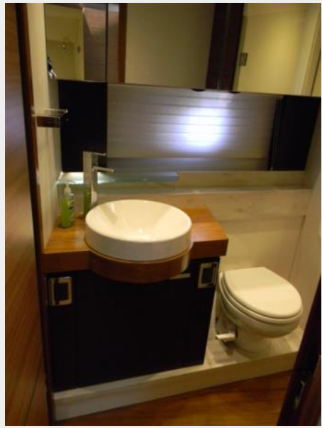
Tiara 50 Flybridge Guest Head