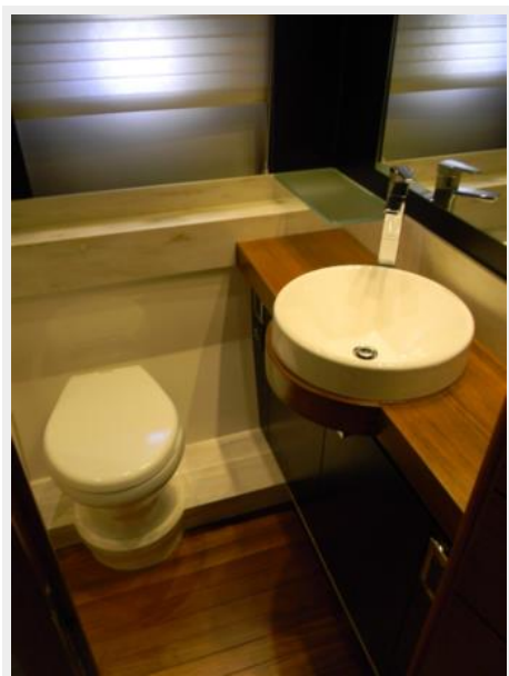
Tiara 50 Flybridge Guest Head