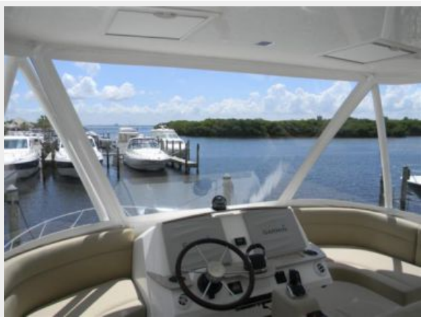
Tiara 50 Flybridge - Flybridge