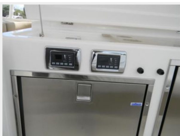
Tiara 50 Flybridge - Flybridge Refrigerator