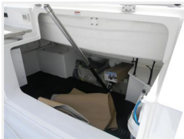
Tiara 50 Flybridge Transom