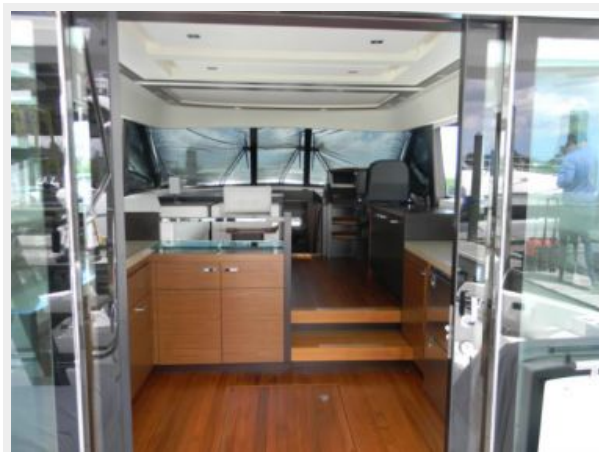
Tiara 50 Flybridge Salon/Galley