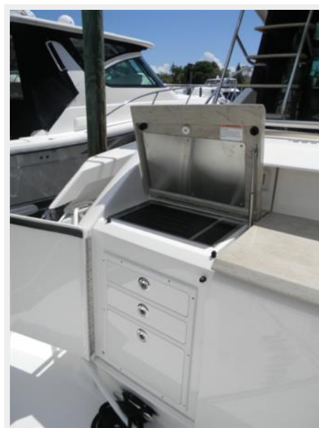
Tiara 50 Flybridge Grill