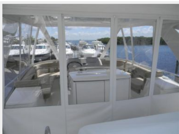
Tiara 50 Flybridge - Flybridge Enclosure