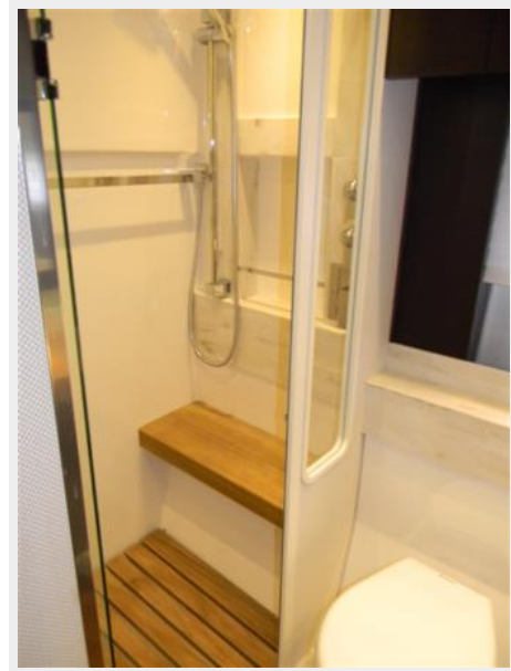
Tiara 50 Flybridge Master Head