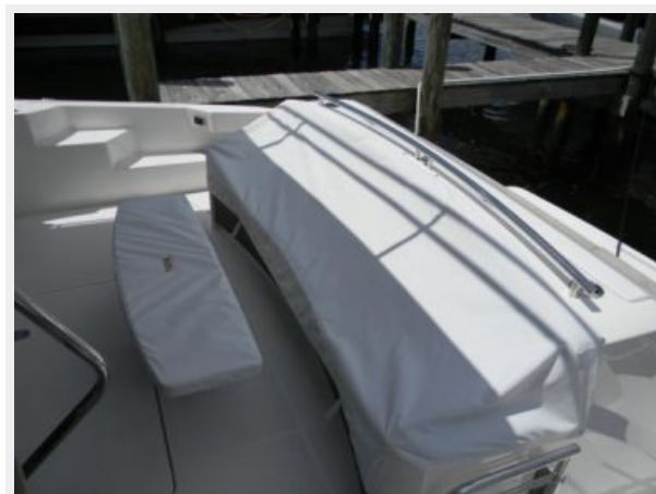
Tiara 50 Flybridge Cockpit Seating Cover