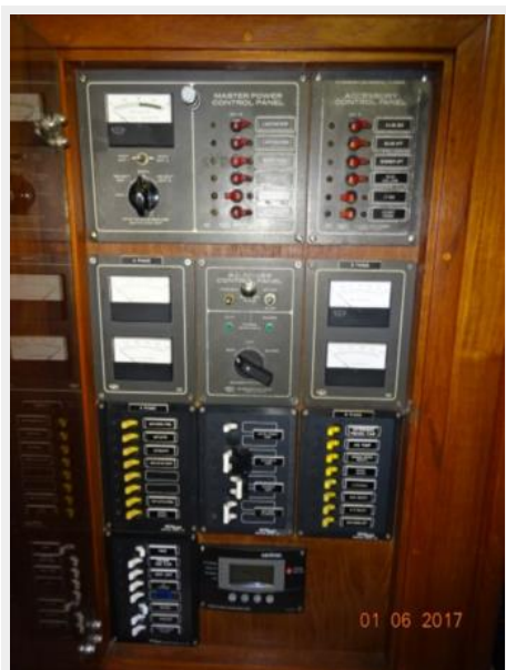
56' Nautical Developments electrical panels