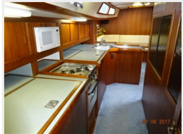
56' Nautical Developments galley photo2