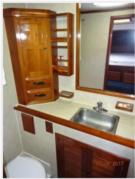
56' Nautical Developments master stateroom head