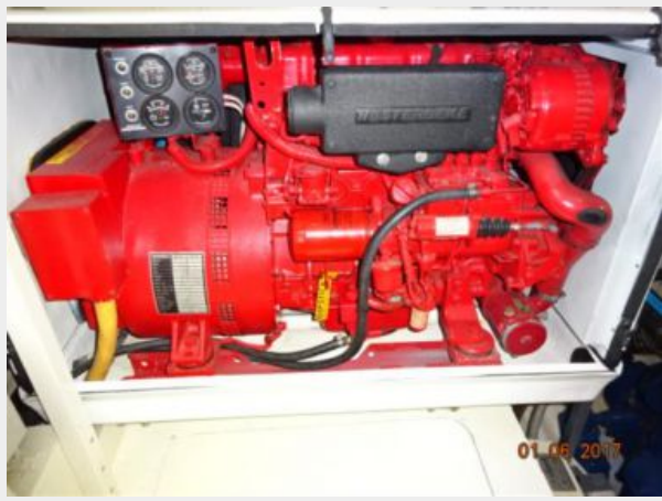
56' Nautical Developments generator