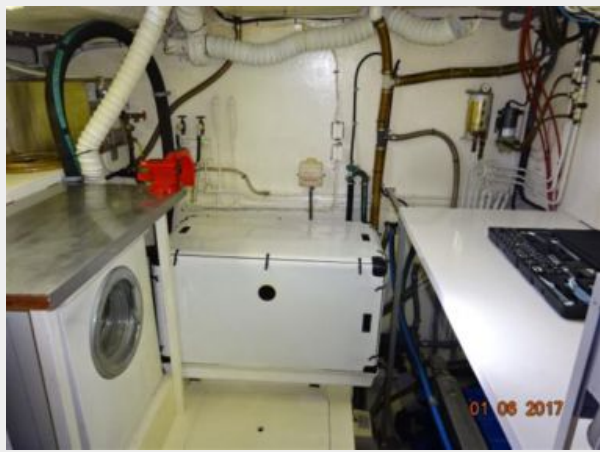
56' Nautical Developments engine room