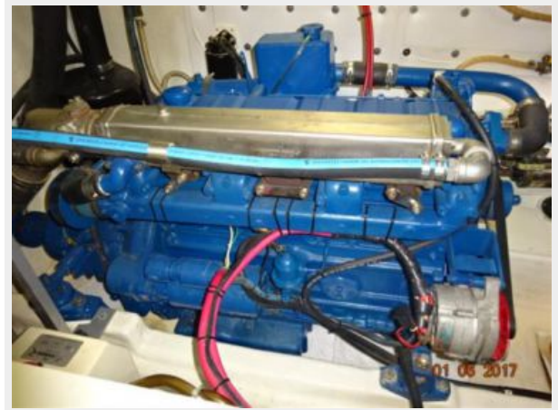
56' Nautical Developments auxiliary