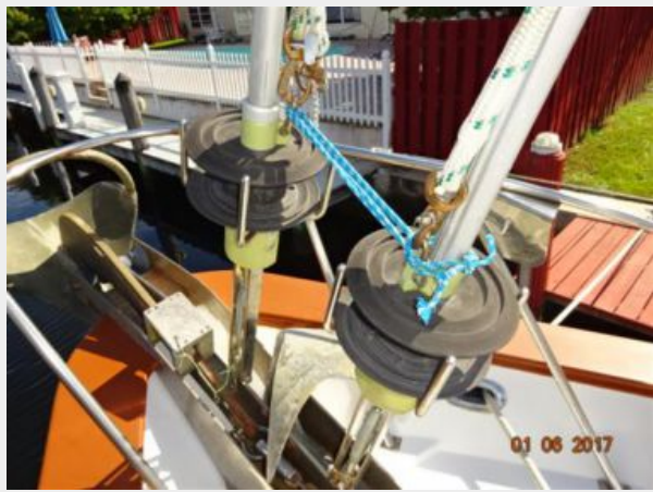
56' Nautical Developments roller furlers