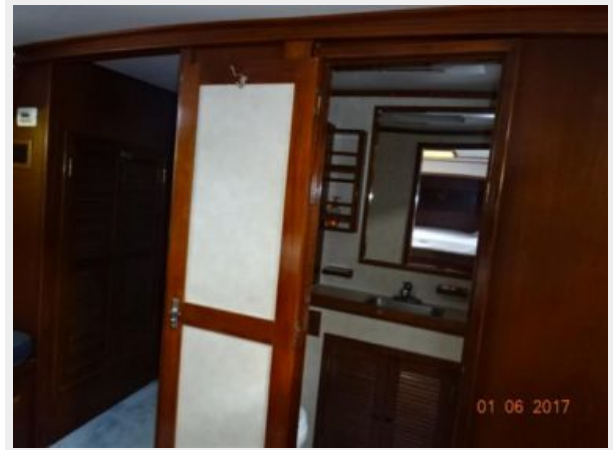
56' Nautical Developments master stateroom forward