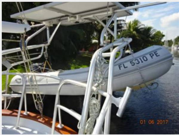
56' Nautical Developments tender photo2