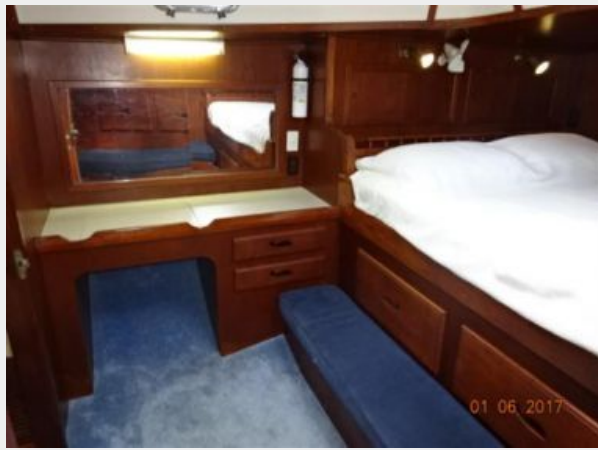
56' Nautical Developments master stateroom starboard