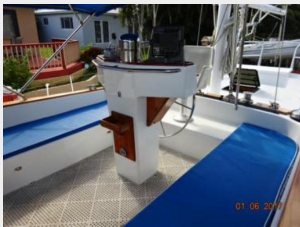
56' Nautical Developments cockpit aft