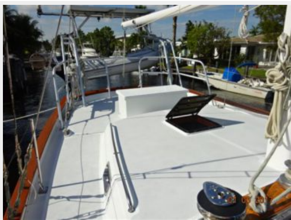
56' Nautical Developments aftdeck