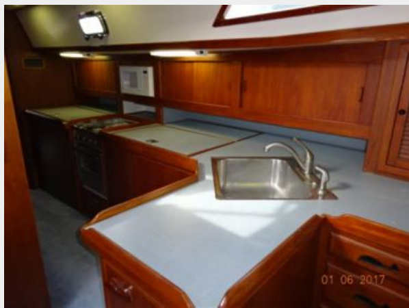
56' Nautical Developments galley photo1