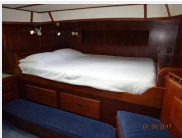
56' Nautical Developments master stateroom