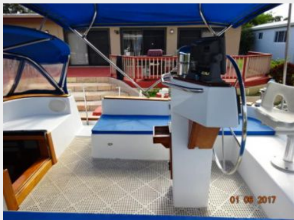
56' Nautical Developments cockpit starboard