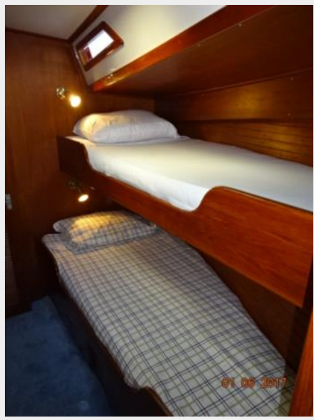
56' Nautical Developments port guest stateroom