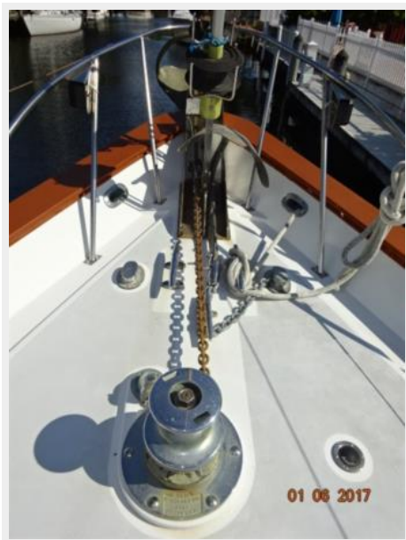
56' Nautical Developments anchor windlass