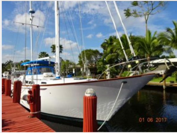
56' Nautical Developments starboard forward profile