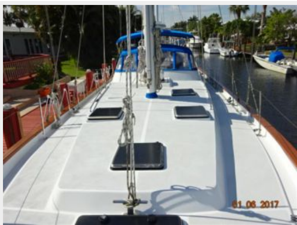
56' Nautical Developments foredeck aft