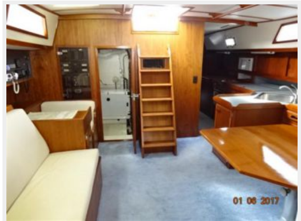
56' Nautical Developments salon aft