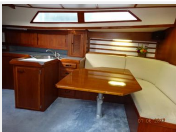
56' Nautical Developments salon port