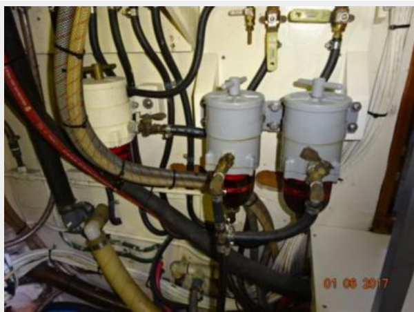
56' Nautical Developments Racor fuel filters