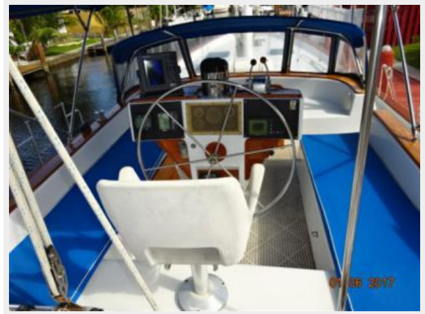
56' Nautical Developments cockpit forward