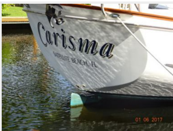
56' Nautical Developments transom