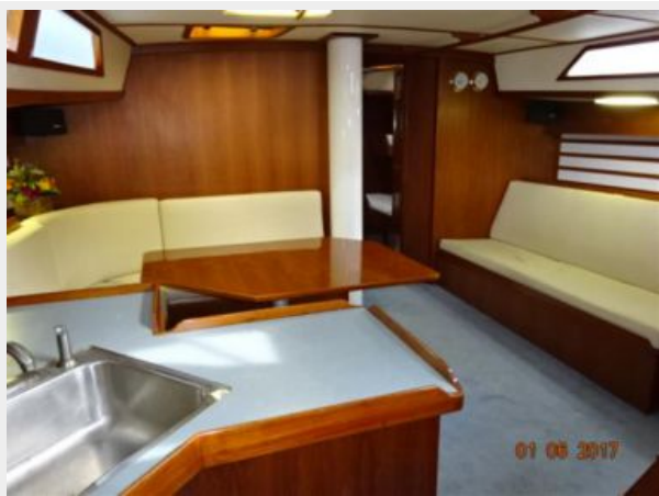
56' Nautical Developments salon forward