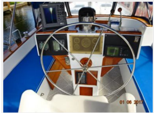
56' Nautical Developments cockpit helm