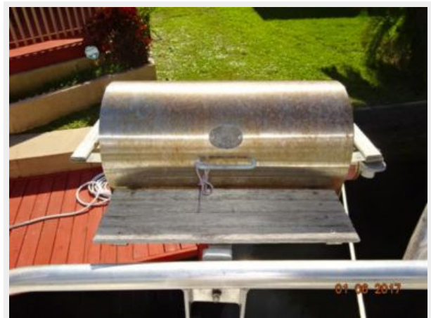
56' Nautical Developments BBQ grill