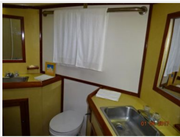
56' Nautical Developments guest head