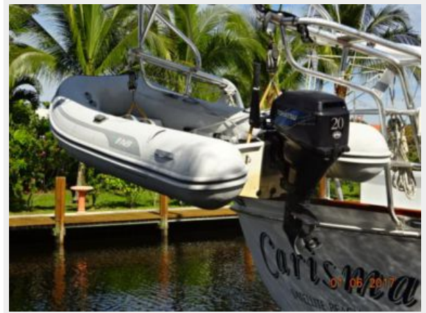
56' Nautical Developments tender photo3