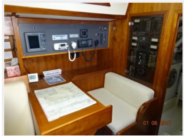
56' Nautical Developments nav station