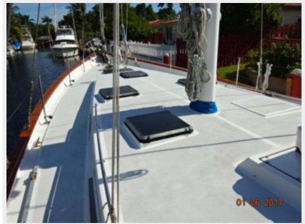
56' Nautical Developments foredeck