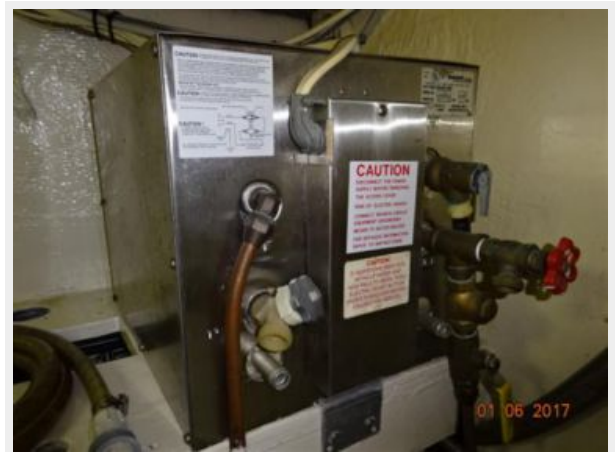
56' Nautical Developments water heater