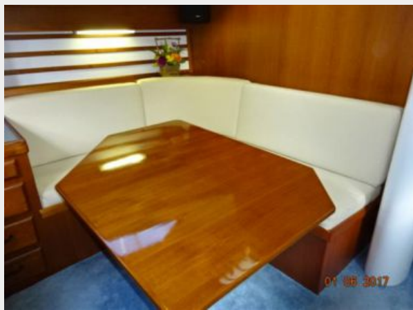
56' Nautical Developments salon port seating