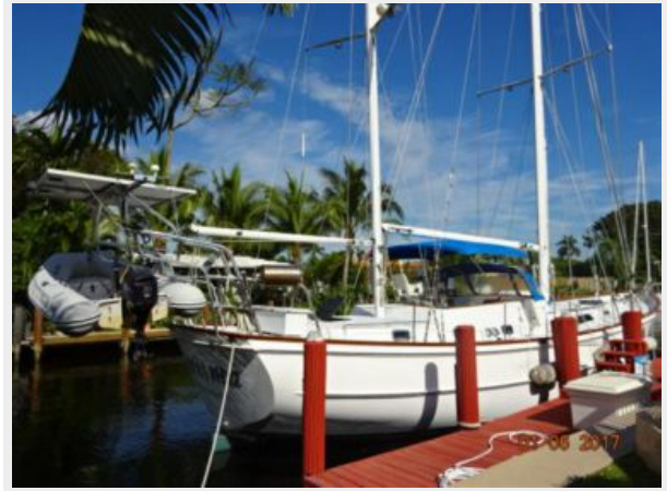
56' Nautical Developments starboard aft profile