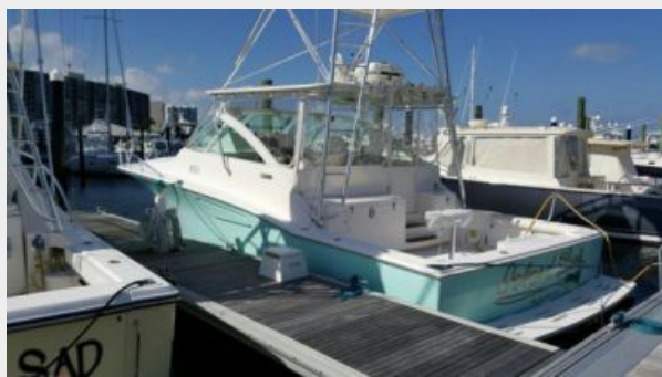
Portside at Dock