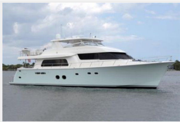
Totally Buffed & Polished