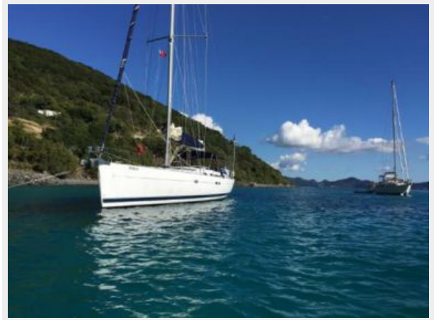
That feeling you get looking at your boat.