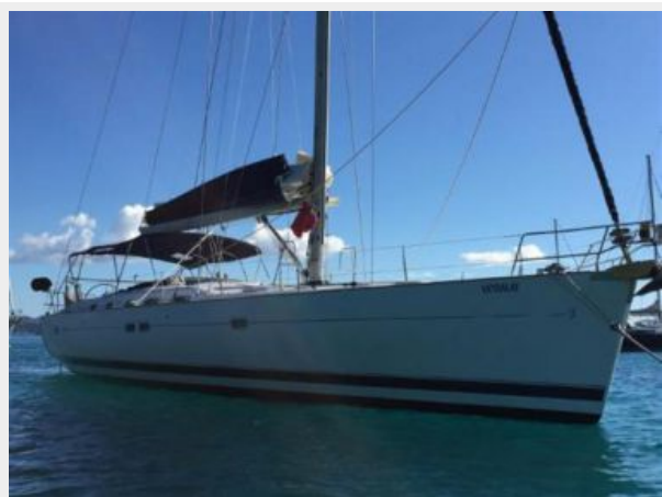
BVI 2017 - Escaping Politics