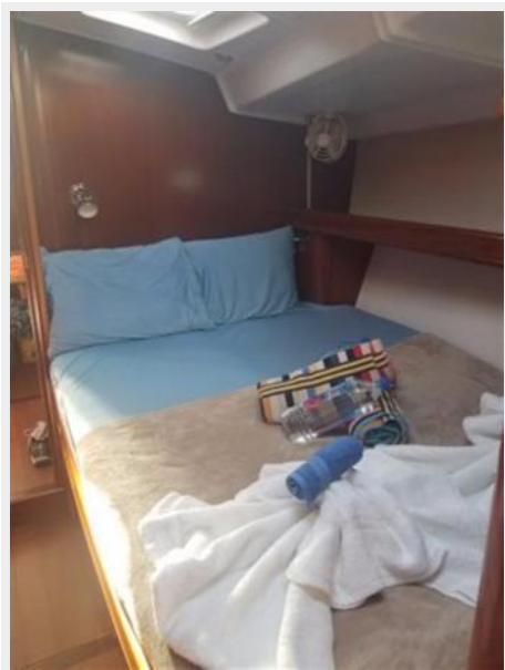
Starboard Fwd Cabin w/ ensuite head