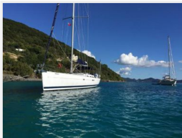
That feeling you get looking at your boat.