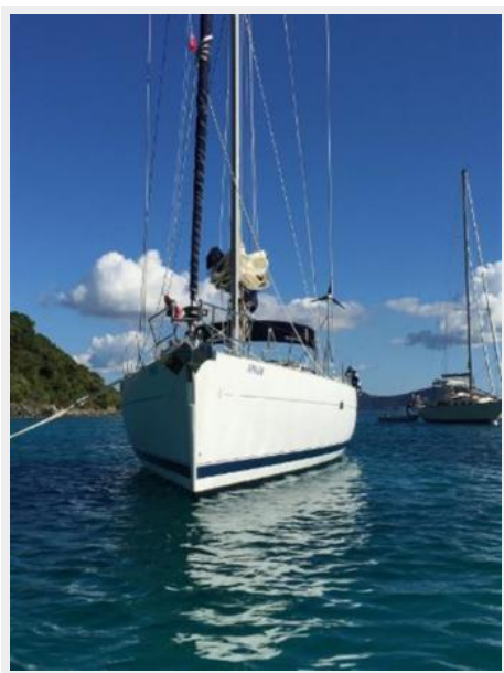
How Sweet it is!