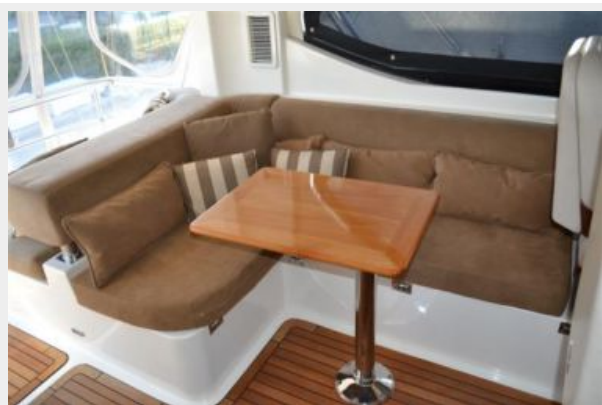
Bridge Deck Seating