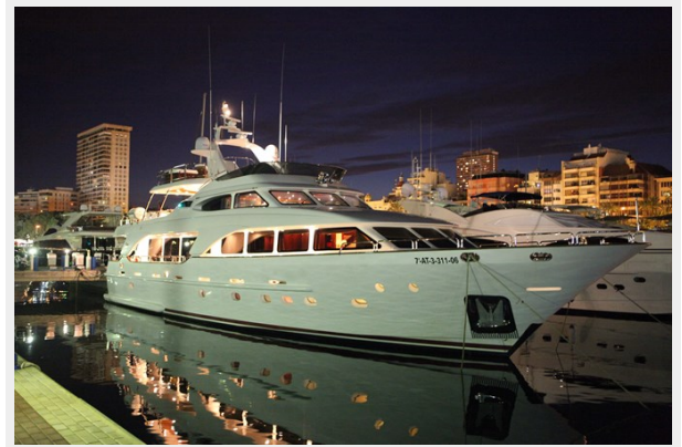
2. barco de noche