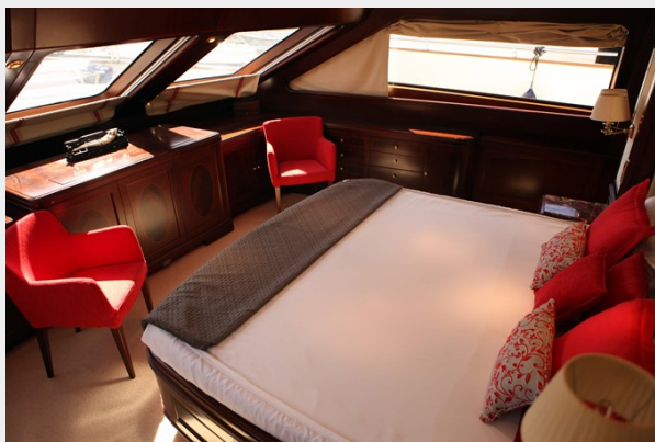
16.camarote principal 3