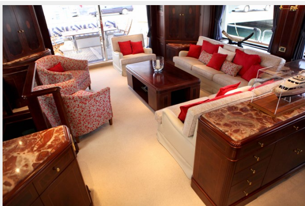
9.salón comedor 4