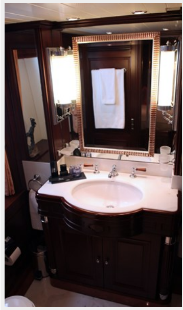
24.baño cama doble 1