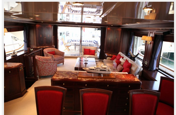
8.salón comedor 3