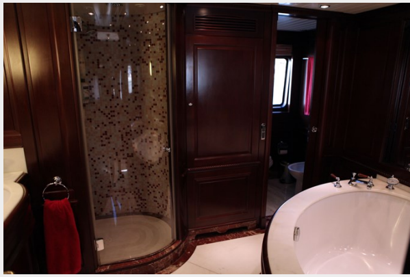
18.baño principal 2