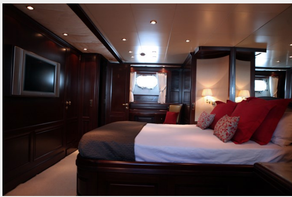
20.camarote invitados 2