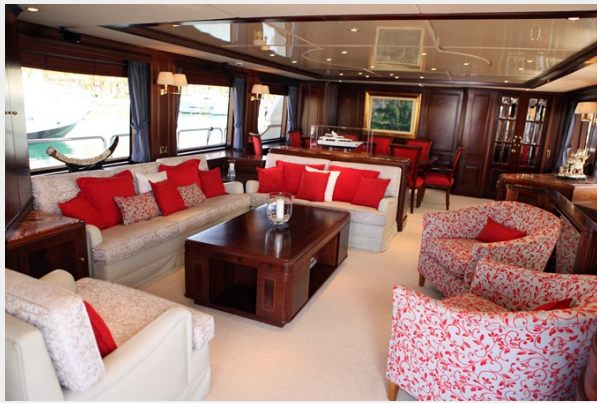
7.salón comedor 2