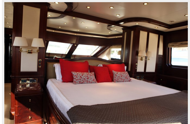
14.camarote principal 1