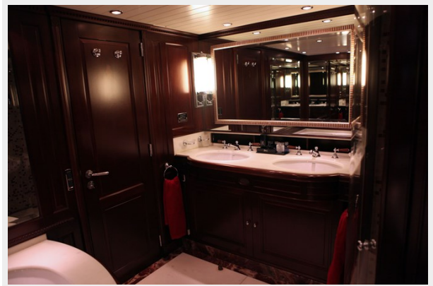
17.baño principal 1