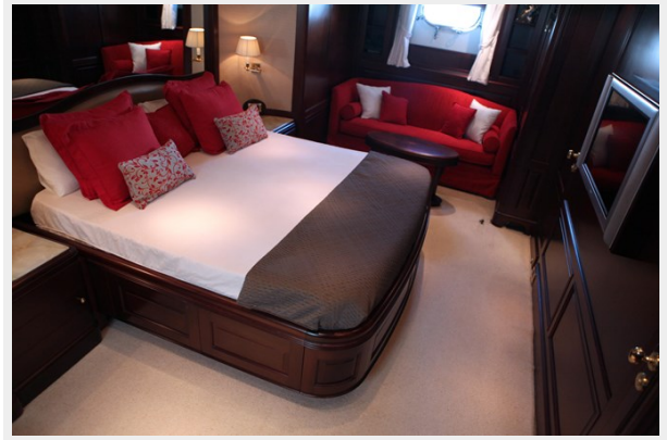
21.camarote invitados 3