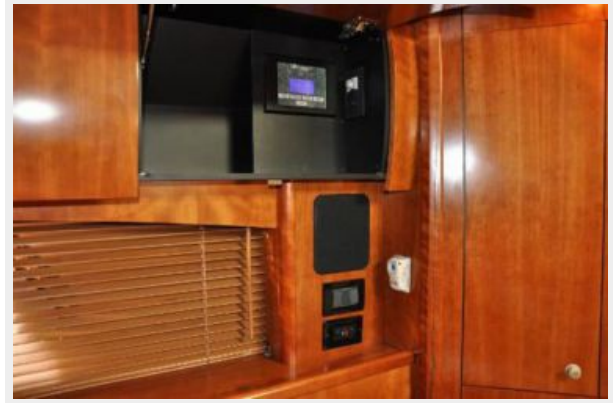
Cruisers Control Panel