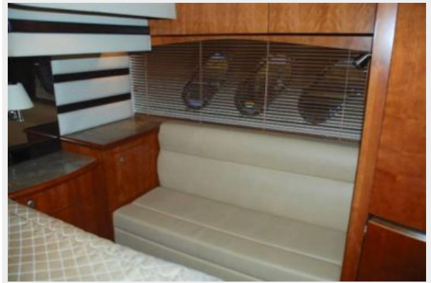
Master Portside Settee