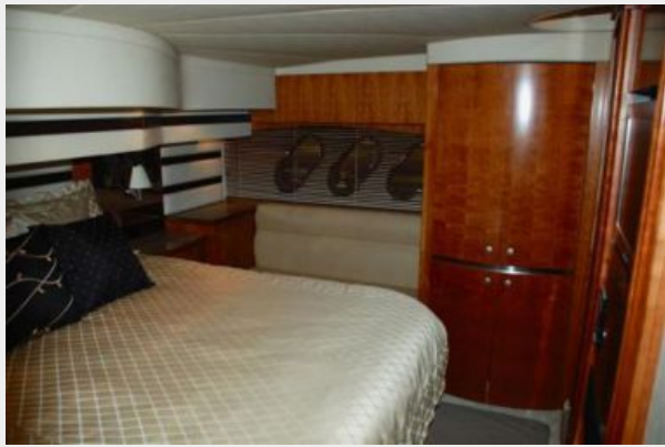
Master Port Side View