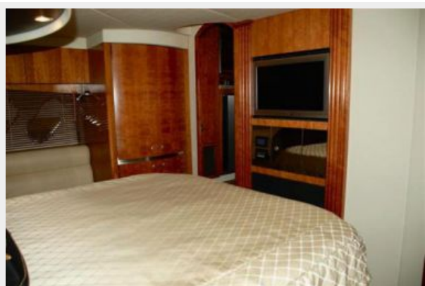
Master Entertainment Center