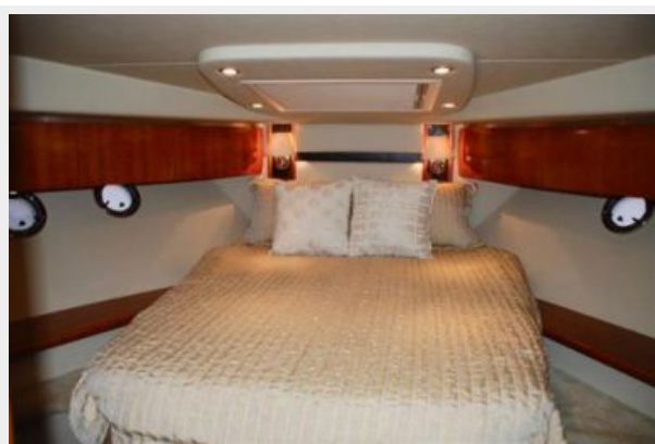
VIP Stateroom Forward