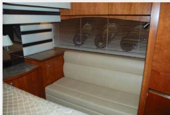
Master Portside Settee