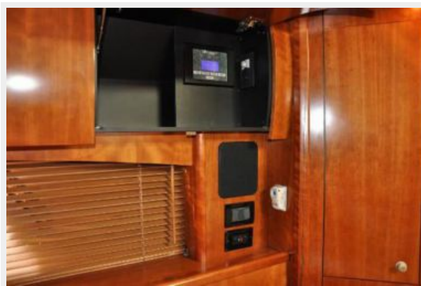
Cruisers Control Panel