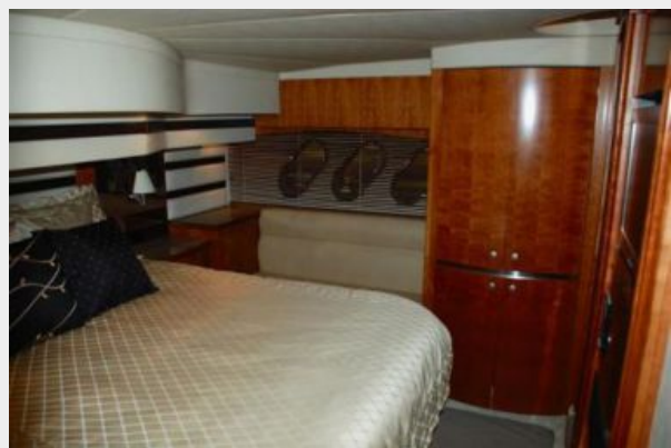
Master Port Side View