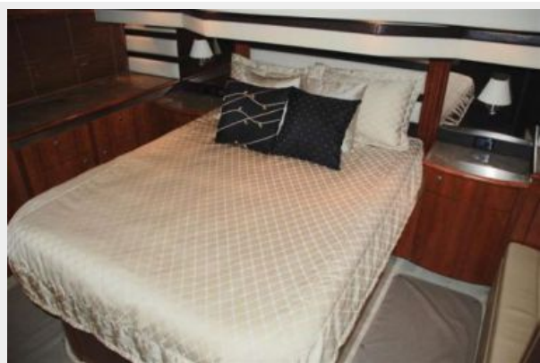
Master Stateroom Carpeted