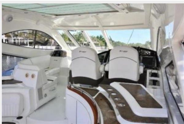
Upper Cockpit Level