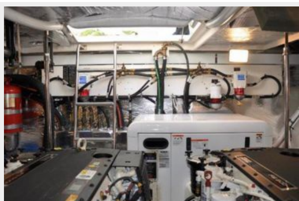
Engine Room Fwd View