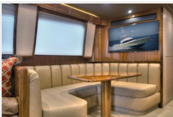
Viking 55 Convertible - Dinette