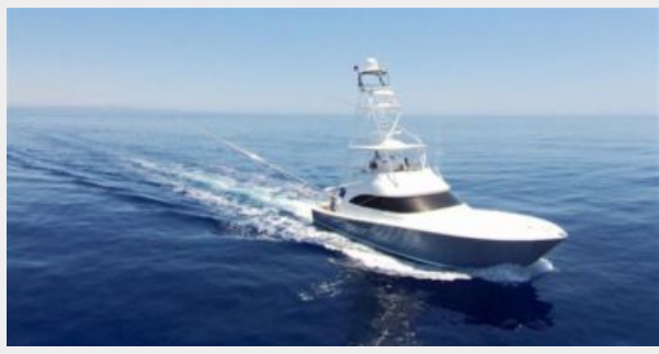
Viking 55 Convertible - Profile