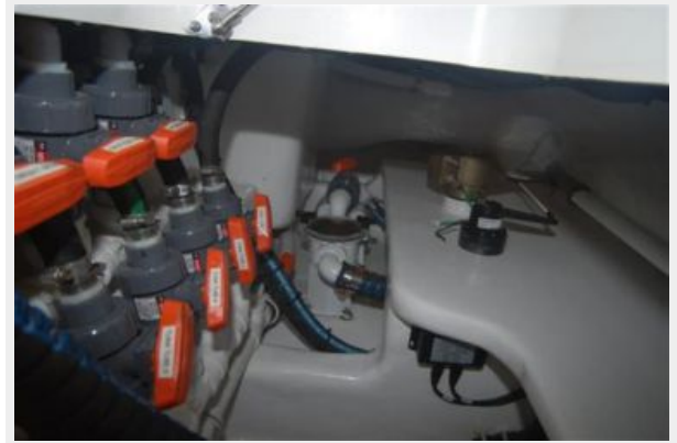
Viking 55 Convertible - Pump controls