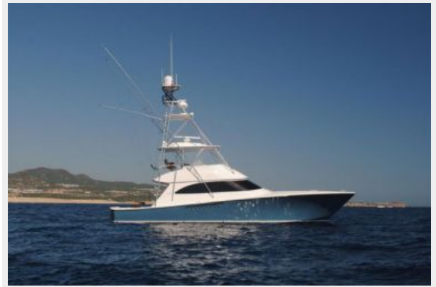
Viking 55 Convertible - Profile Starboard