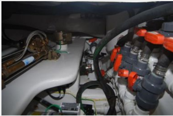
Viking 55 Convertible - Pump Controls