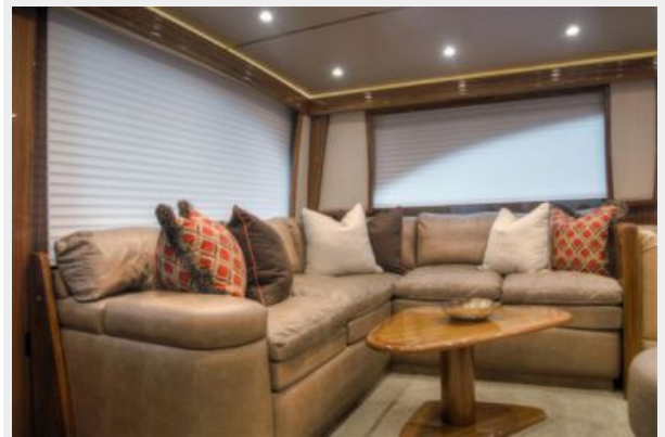
Viking 55 Convertible - Salon