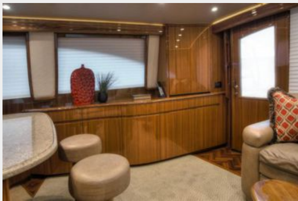
Viking 55 Convertible - Salon Entry