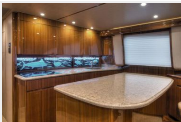
Viking 55 Convertible - Galley