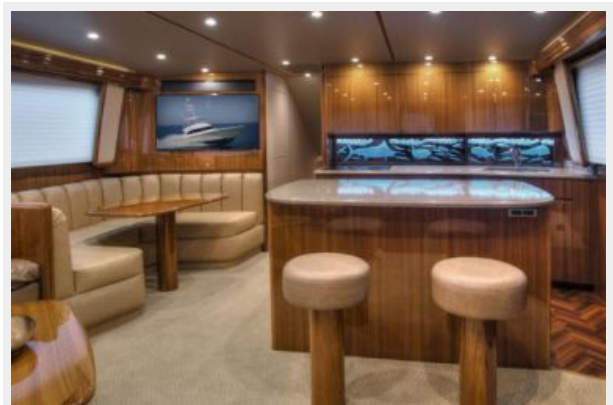
Viking 55 Convertible - Galley/Dinette